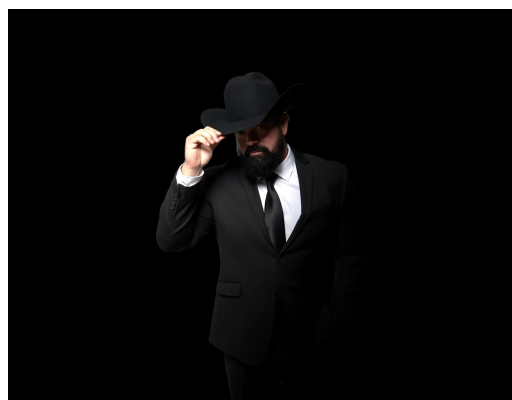
HEADSHOT · SQUARE · SOCIAL & THUMBNAILS