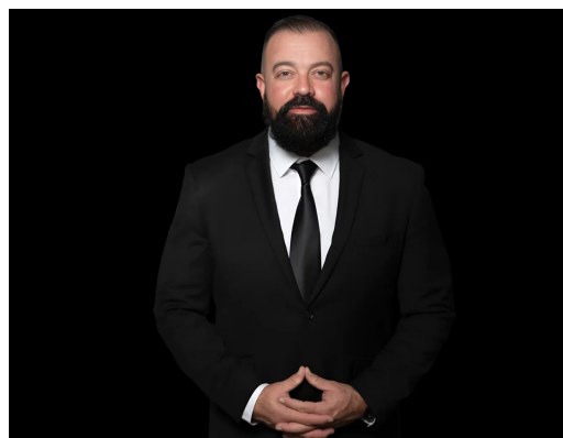
FORMAL · FOR PROGRAMS & PRESS RELEASES