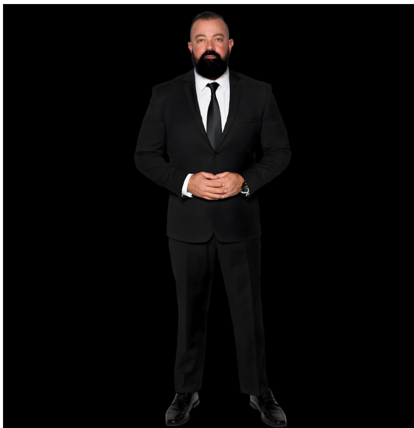
PRIMARY PORTRAIT · VERTICAL · FOR POSTERS & MAIN PROMO