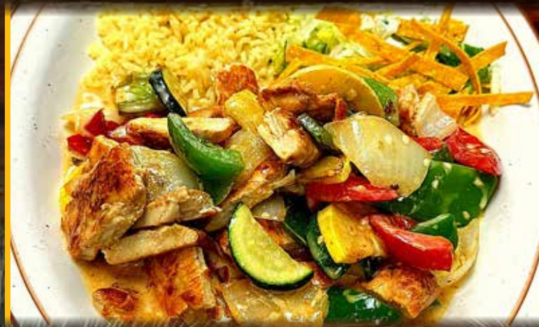
Pollo con Crema