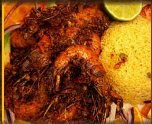
Camarones Don Buyo's