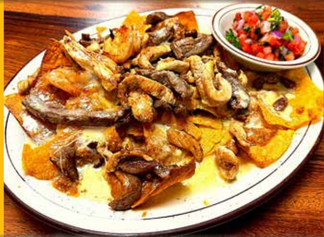
Nachos Don Buyo's