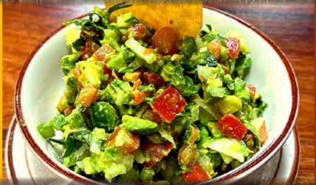
Guacamole La Casa