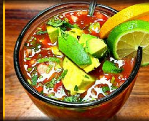
Còctel de Camarón

*WARNING: CONSUMING RAW OR UNDERCOOKED MEAT, POULTRY, EGGS, SHELLFISH OR SEAFOOD INCREASES YOUR RISK OF FOODBORNE ILLNESS.