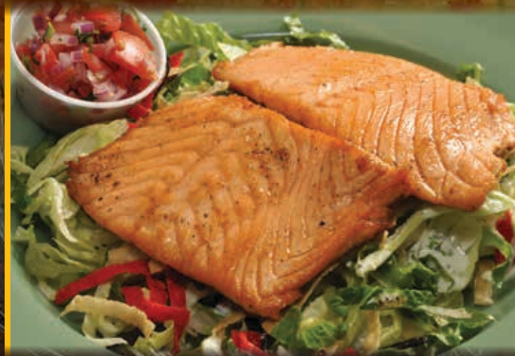
Grilled Salmon Salad