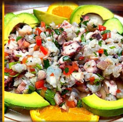
Camarones y Pulpo Ceviche