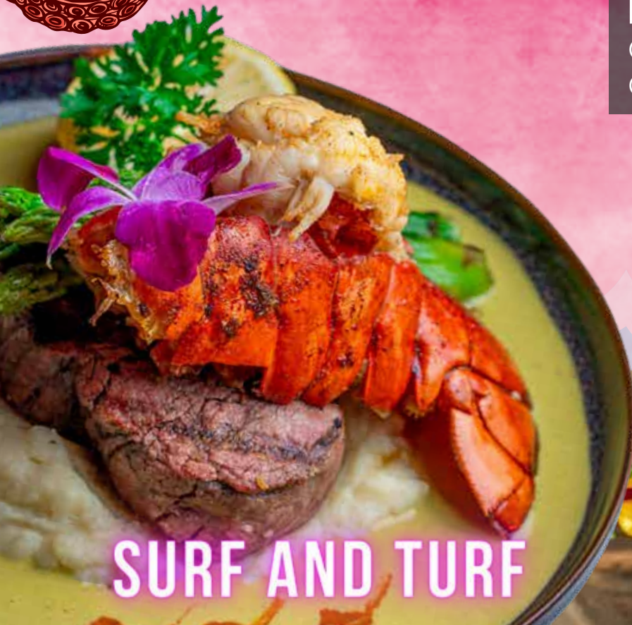
SURF AND TURF

CHAR GRILLED OCTOPUS, PASTOR ADOBO, COCONUT RICE, CAMBRAY ONION, GRILLED PINEAPPLE. ROASTED JALAPEÑO.