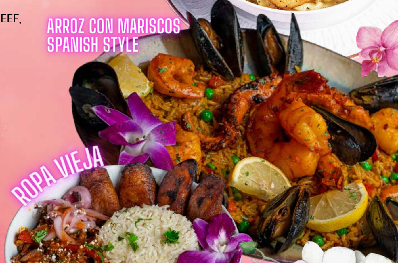
ARROZ CON MARISCOS SPANISH STYLE