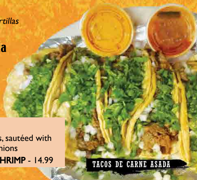
TACOS DE CARNE ASADA

STEAK OR CHICKEN - 13.99 | SHRIMP - 14.99