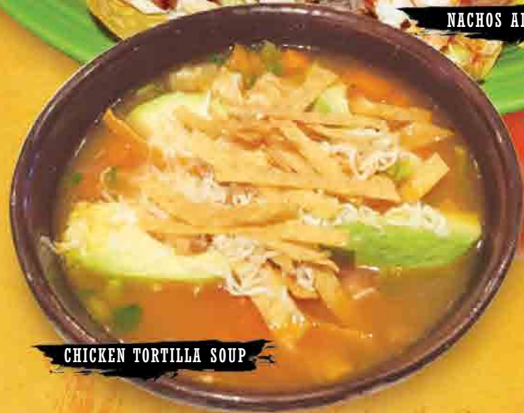
CHICKEN TORTILLA SOUP