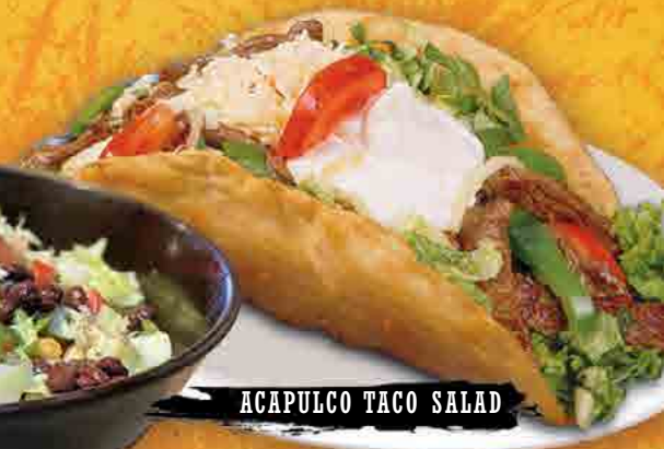
ACAPULCO TACO SALAD