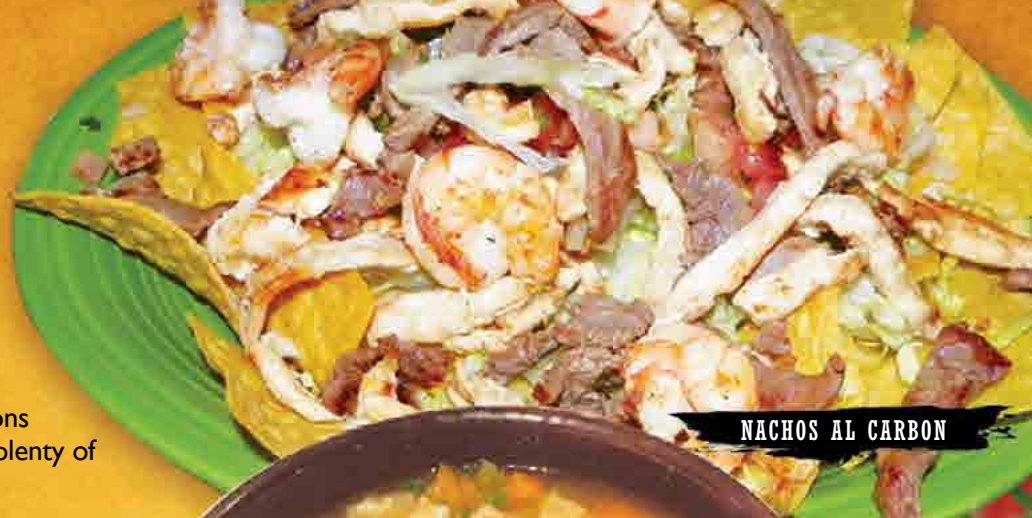
NACHOS AL CARBON

Your choice of grilled chicken or steak with lettuce, shredded cheese, guacamole, sour cream and pico de gallo - 15.49