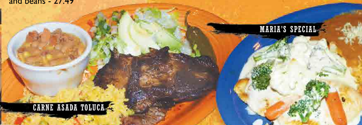
CARNE ASADA TOLUCA