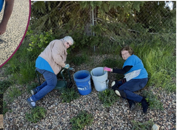
A "laid back" weeding technique leaves not a weed between them.