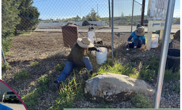
Under the knee is a unique weeding technique.