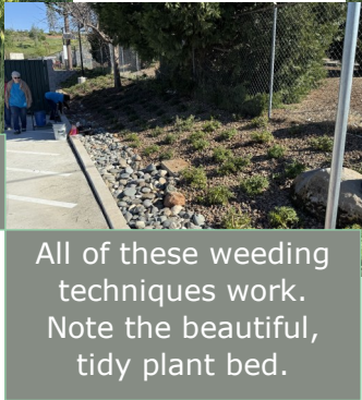
All of these weeding techniques work. Note the beautiful, tidy plant bed.