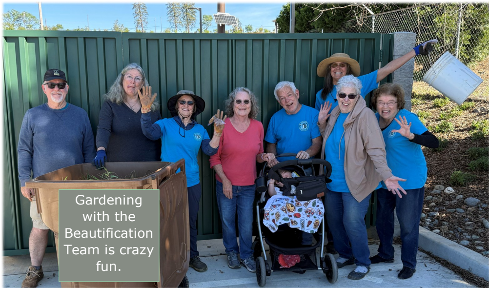
Gardening with the Beautification Team is crazy fun.