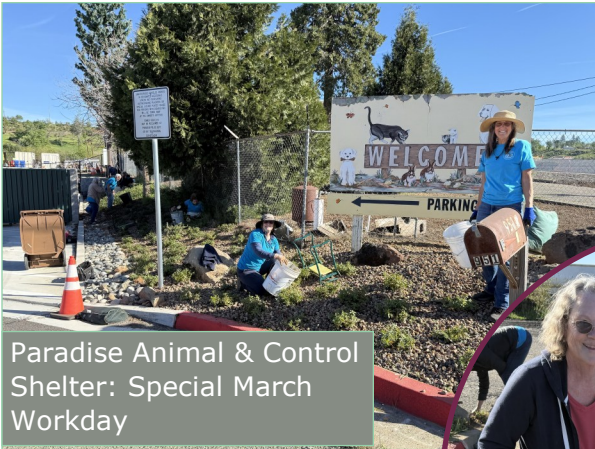
Paradise Animal & Control Shelter: Special March Workday