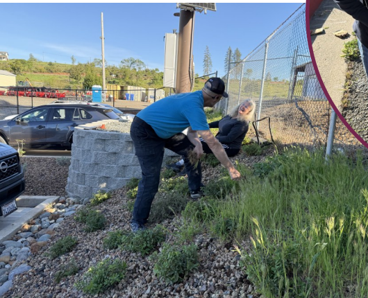
Laughing the weeds away creates good energy