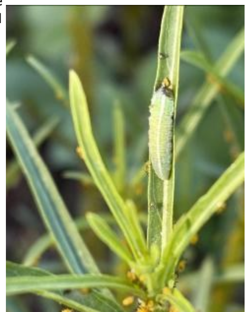
"Hoverfly larvae are beneficial insects that act as natural pest control by consuming aphids, mites, and other small insects."