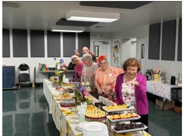
Behind the scenes... our hardworking Board are a very serious group...? Seriously fun, which adds to the warmth and relaxed atmosphere of all meetings.