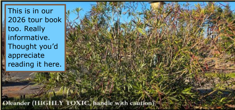
Oleander (HIGHLY TOXIC, handle with caution)

This is in our 2026 tour book too. Really informative. Thought you'd appreciate reading it here.