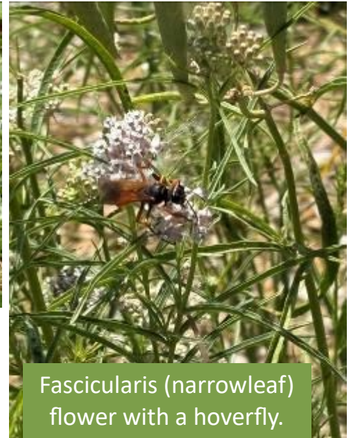
Fascicularis (narrowleaf) flower with a hoverfly.

monarch caterpillars can only eat milkweed, nothing else. The milkweed grows back in a matter of weeks, no harm to your garden. You can snip it a bit for a bushier plant if desired.