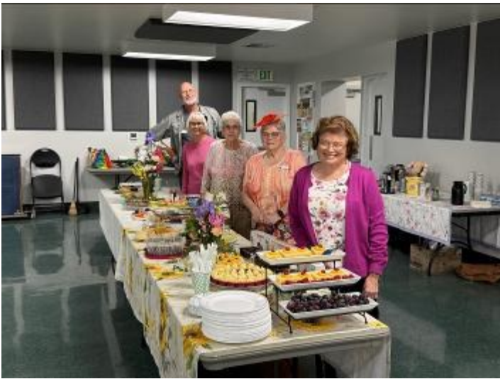
Our welcoming PGCi Board each hosted a table. Just look at what the members brought in to share! A plethora of teas and interesting coffee too.