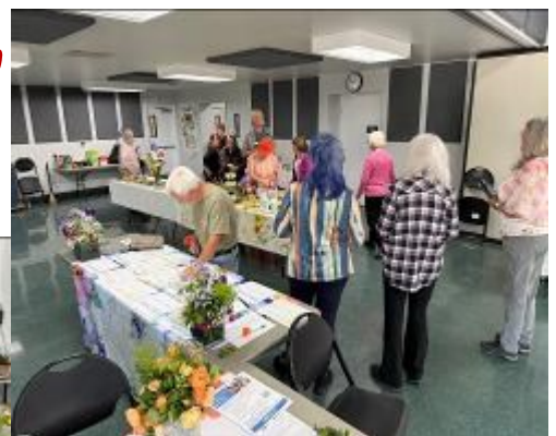
Bouquets on tables for serving, greeting and membership were created by members of the Hospitality Team from their gardens.