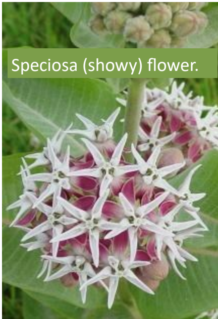
Speciosa (showy) flower.

A butterfly garden is a place many of us want to include in our Paradise Landscape. One essential plant to incorporate is resilient perennial, milkweed. The flowers are lovely and delicate, but the critical reason to cultivate them is to provide a haven for Monarch butterflies. They cannot survive without it. Planting as little as a cluster of ten plants provides shelter for monarch caterpillars.