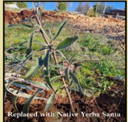
Replaced with Native Yerba Santa