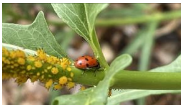
The yellow lumps are sap sucking oleander aphids to be vanquished by the lady in red.

Then into your garden, aphids will come to suck the sap from your plants, especially new growth and they love milkweed. That is a bug that bugs a gardener! Yet, a ladybug or Hoverfly larvae can eat all the aphids very quickly. Please do not use pesticides. There is balance in nature, and you can watch it happen! Get to