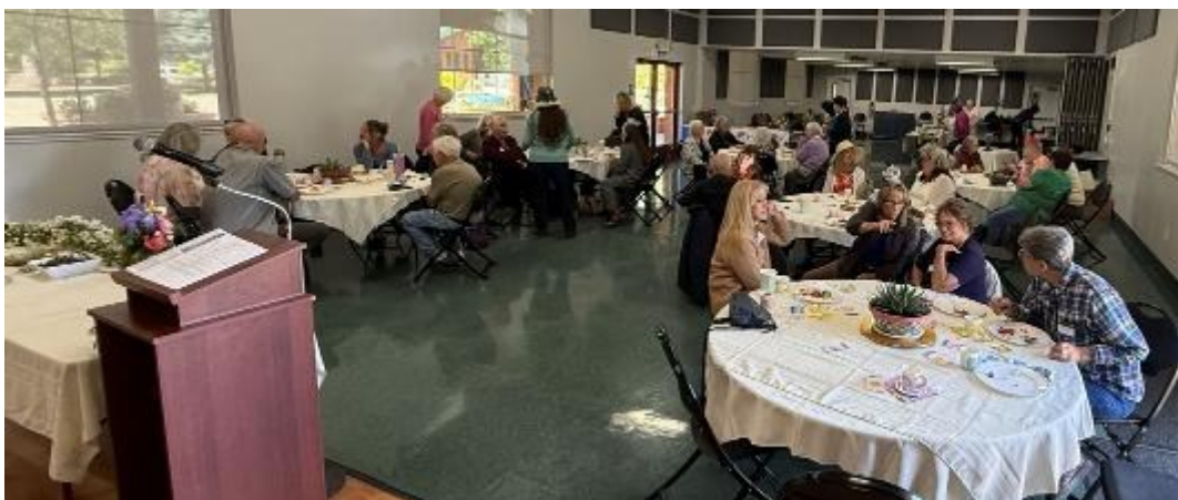
Gardeners, here we are enjoying each other. We joined this group because we each want to better understand how to garden and landscape on the Ridge. Every month, through speakers, local professionals, and hands on experience, we learn what plants help clean our air and earth as well as look beautiful and provide us with food. As we work the ground, we talk to each other, always learning. This is one of the reasons we gather and kick back like this. Gardeners have a lot to share.