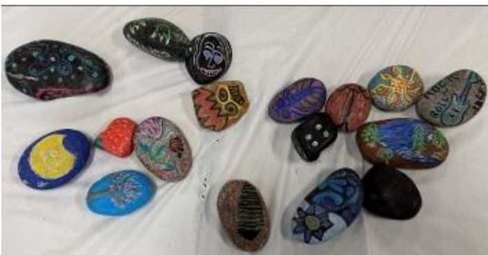
Acrylic Painting of rocks, pots & stepping stones ready for sale at the Hub.