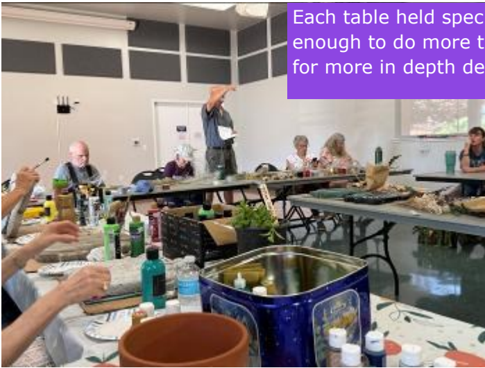
Each table held specific art projects. Quick enough to do more than one, or take longer for more in depth detail.