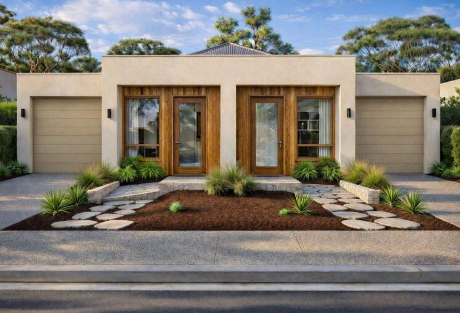
Duplex Arizona (+$28,000)