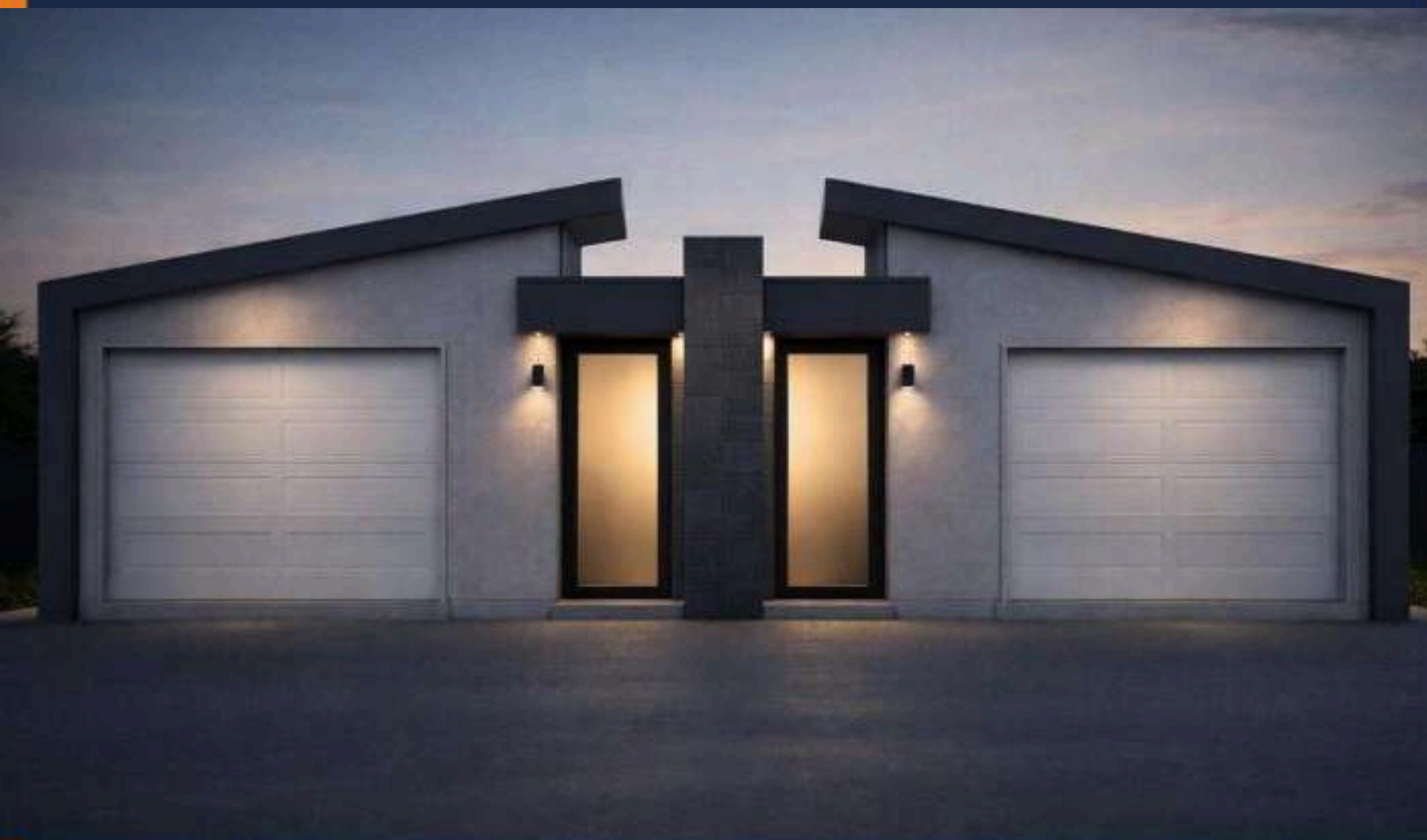
Duplex Bond (+$30,000)