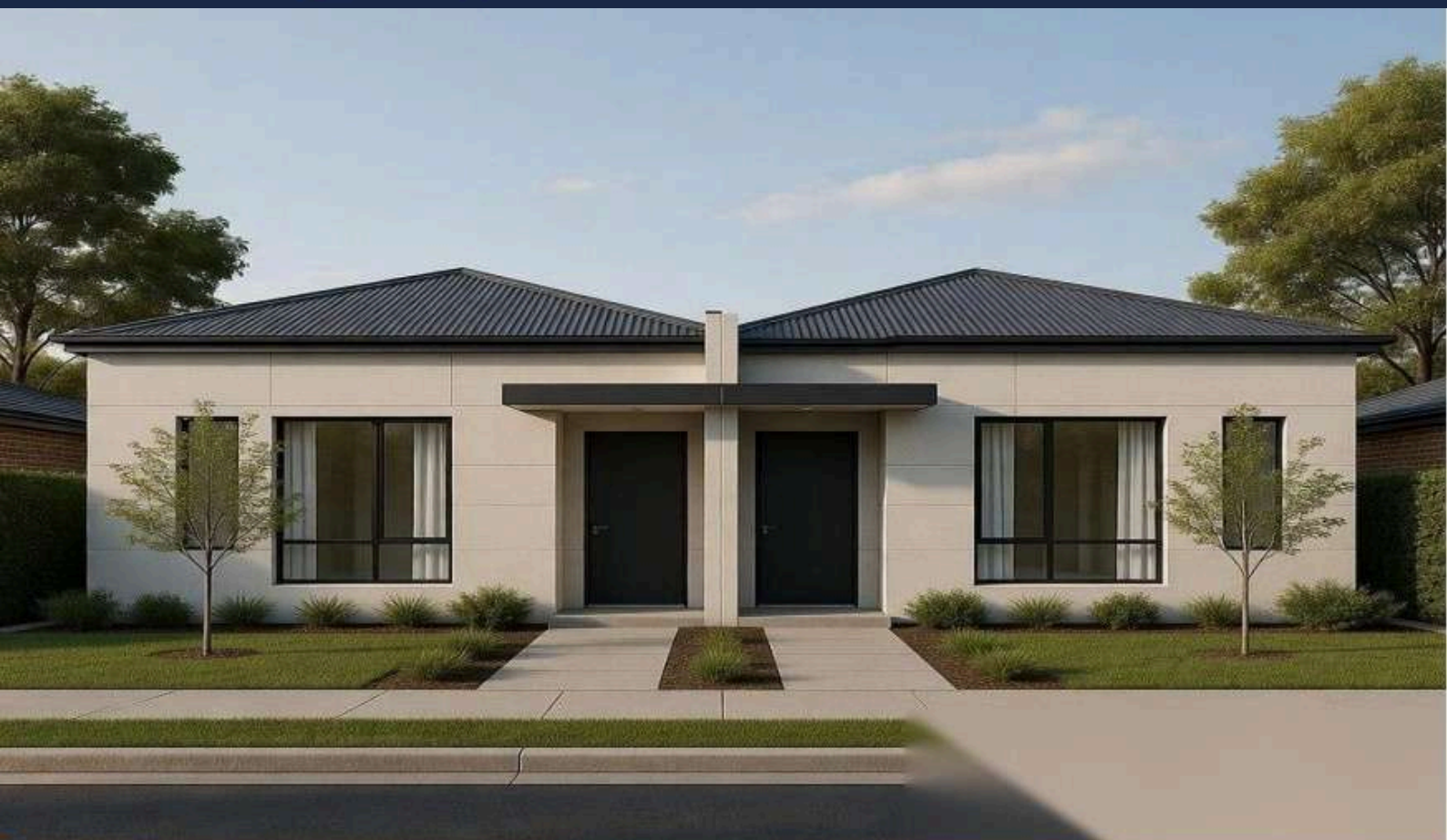
Duplex Clinton (+$20,000)