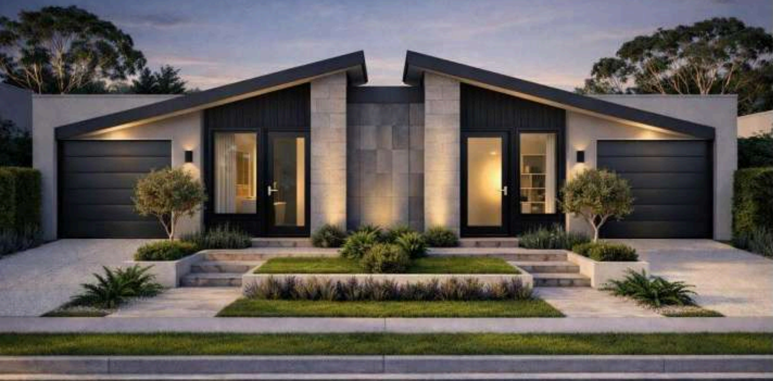
Duplex Signature (+$50,000)