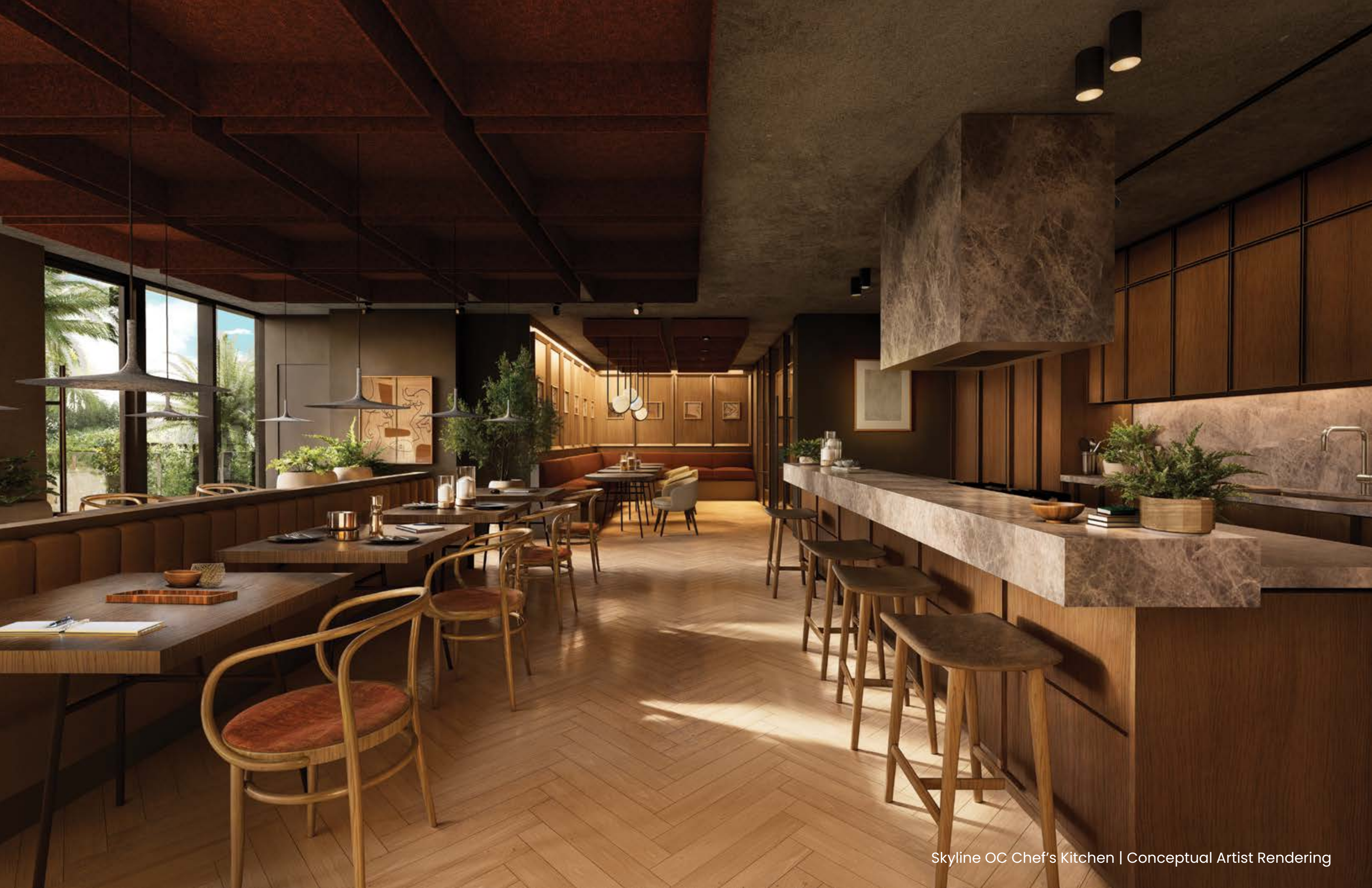
Skyline OC Chef's Kitchen | Conceptual Artist Rendering