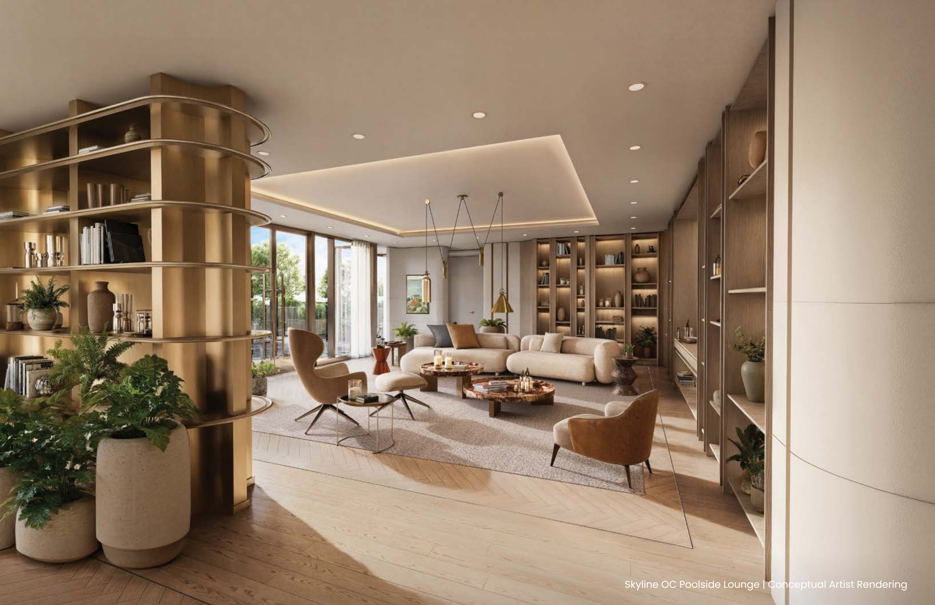
Skyline OC Poolside Lounge | Conceptual Artist Rendering