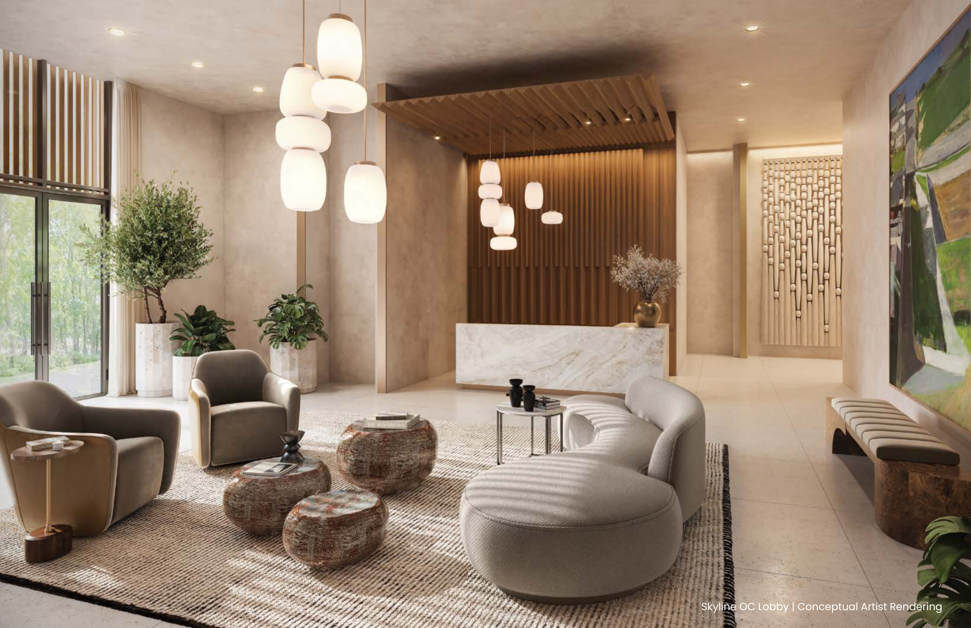
Skyline OC Lobby | Conceptual Artist Rendering