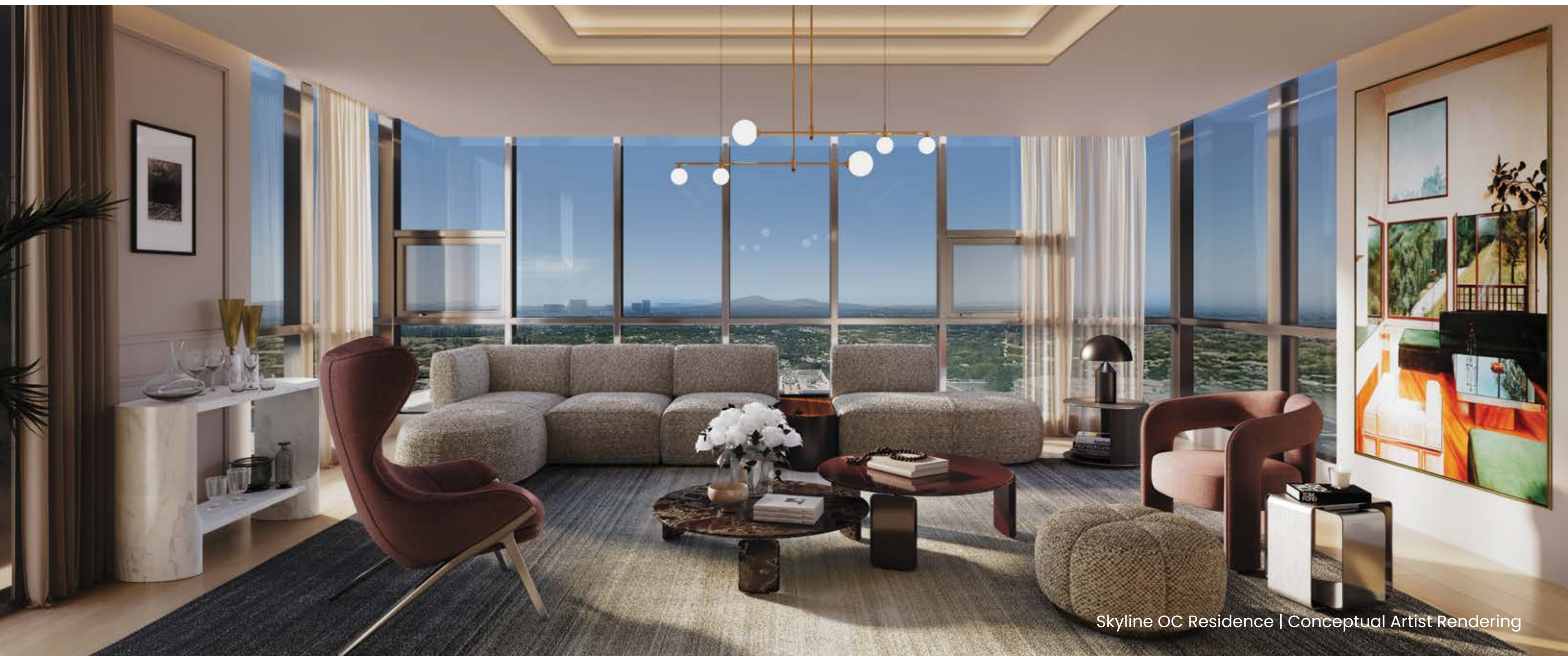
Skyline OC Residence | Conceptual Artist Rendering