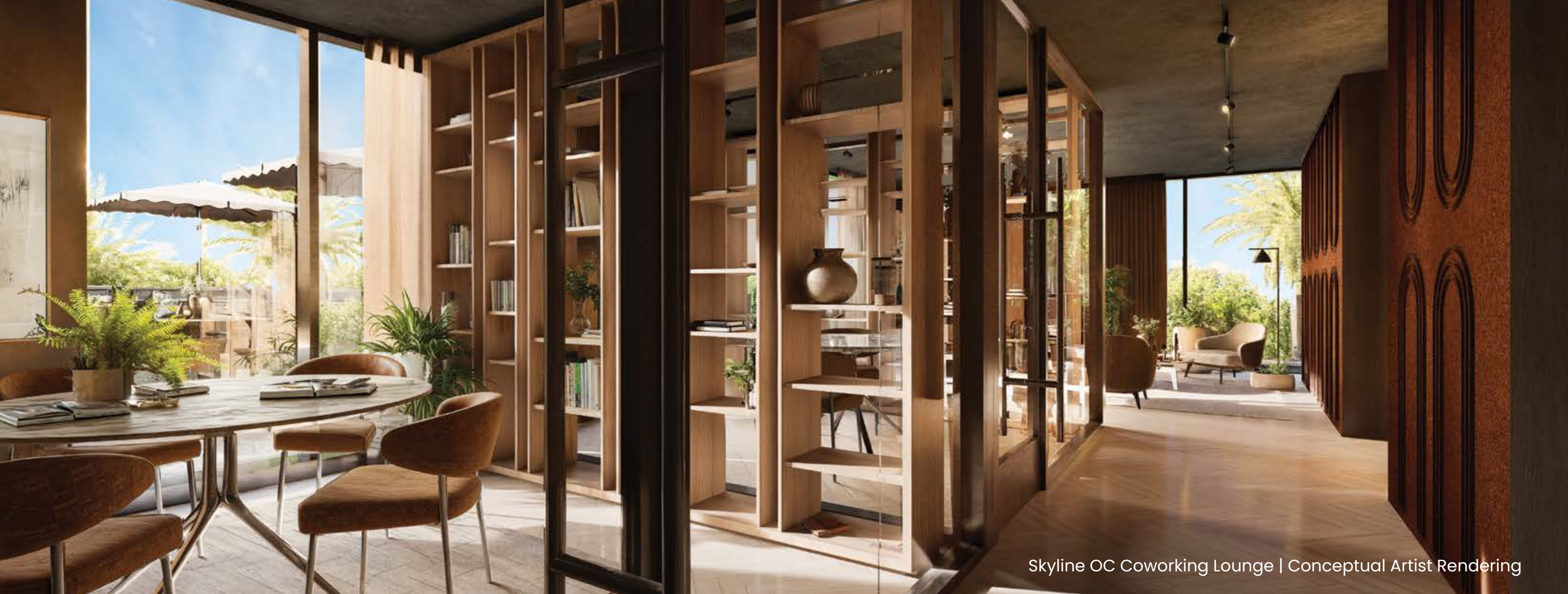
Skyline OC Coworking Lounge | Conceptual Artist Rendering