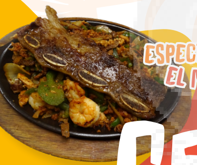
ESPECIAL EL MEXICO

Grilled chicken tender and rice covered with cheese sauce and tortillas.