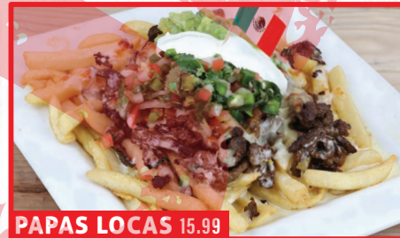
PAPAS LOCAS 15.99

Chicken breast, carne asada, corn on the cob, jalapenos and special sauce. Served with rice, beans, salad and tortillas.