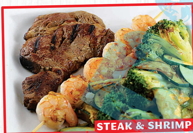
STEAK & SHRIMP

CARNE ASADA 22.99 Grilled steak served with rice, beans, lettuce, tomatoes and avocado.