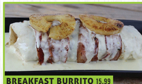
BREAKFAST BURRITO 15.99

Burrito filled with steak, potatoes and eggs. Topped with bacon, pineapple and cheese dip.