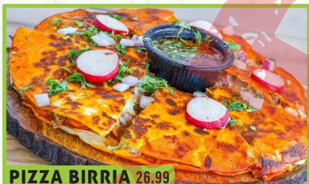
PIZZA BIRRIA 26.99

Three shrimp tacos with spicy bang-bang sauce, topped with cilantro.