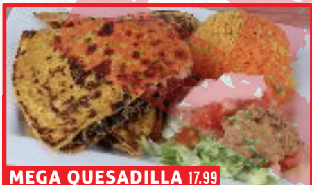
MEGA QUESADILLA 17.99

Burrito filled with steak, potatoes and eggs. Topped with bacon, pineapple and cheese dip.