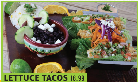
LETTUCE TACOS 18.99

Lettuce tacos filled with choice of chicken, steak or fish with pico de gallo, carrots and queso fresco. Served with black beans, cucumber and white rice.