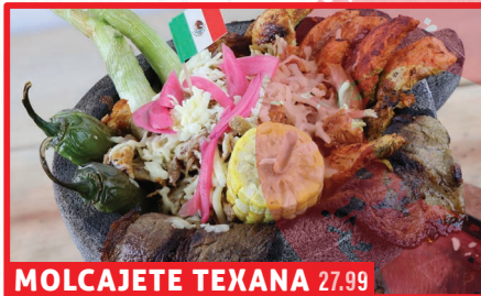
MOLCAJETE TEXANA 27.99

Pork chop, half roasted chicken, salchichas and one cheese quesadilla. Served with pinto beans and queso fresco.