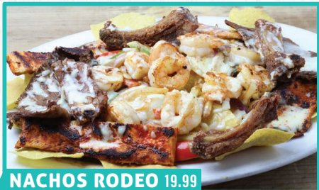
NACHOS RODEO 19.99

Fries with grilled steak, cheese, sour cream, pico de gallo and guacamole.