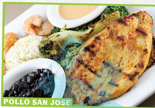
POLLO SAN JOSE

POLLO JALISCO 17.99 Grilled chicken breast cooked with onions, tomatoes, bell peppers, yellow squash and zucchini. Served with rice and beans.