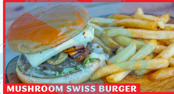
MUSHROOM SWISS BURGER