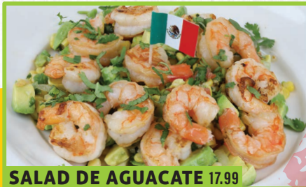
SALAD DE AGUACATE 17.99

Lettuce tacos filled with choice of chicken, steak or fish with pico de gallo, carrots and queso fresco. Served with black beans, cucumber and white rice.