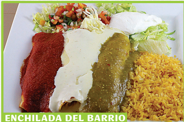
ENCHILADA DEL BARRIO