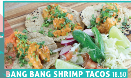
BANG BANG SHRIMP TACOS 18.50

Three birria tacos with onions, cilantro and cheese. Served with lettuce, tomato, cucumber, onions and side of consome.