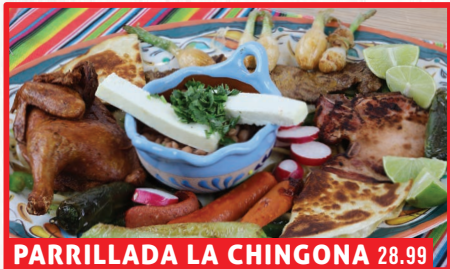
PARRILLADA LA CHINGONA 28.99

Three tacos with a soft and hard tortilla filled with steak, mac and cheese, corn and cabbage salad.