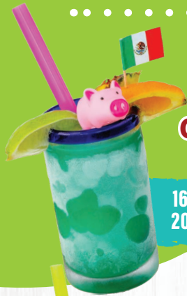
BLUE COTTON CANDY