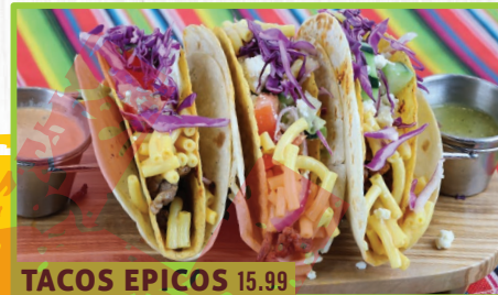
TACOS EPICOS 15.99

Shrimp, avocado, tomatoes, onions, cilantro, corn and lime juice.