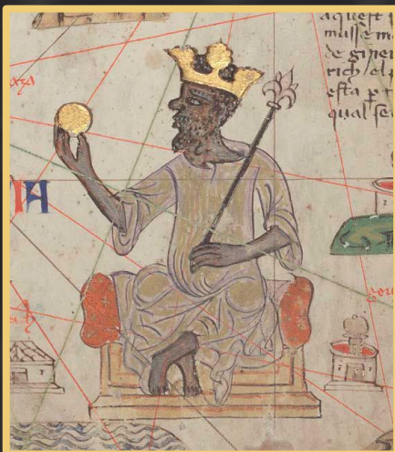
Mansa Musa depicted holding a gold coin from the 1375 Catalan Atlas.

Inflation doesn't move evenly across everything you buy. Prices for essentials like shelter and certain services can rise at a different pace than the overall inflation rate, which is why many households feel inflation differently even in the same year. 15