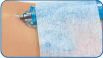
Recommended taping technique

Smarter Safety. Same Simple Process. Built-In Protection Against VND Related Complications