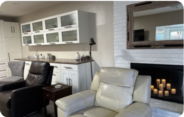
Note: Indoor fireplaces are for ambiance only (flameless candles). Security cameras are exterior-only (driveway + side-yard entry).