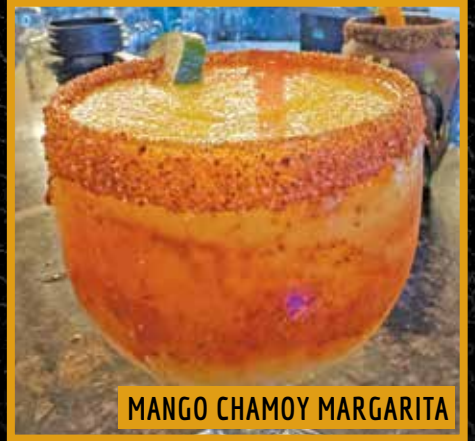
MANGO CHAMOY MARGARITA