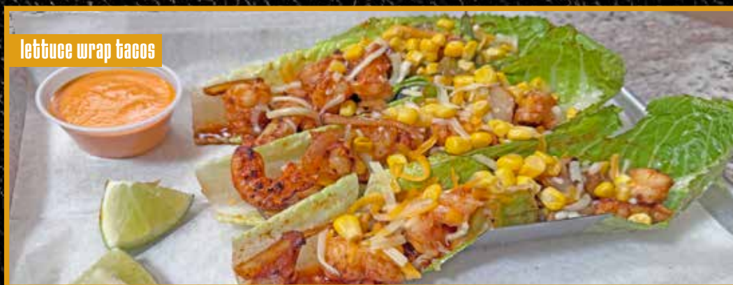
lettuce wrap tacos