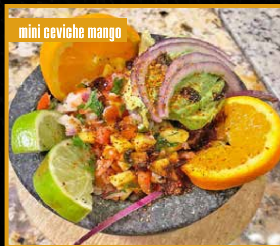
mini ceviche mango