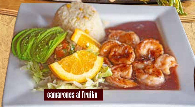
camarones al fruto