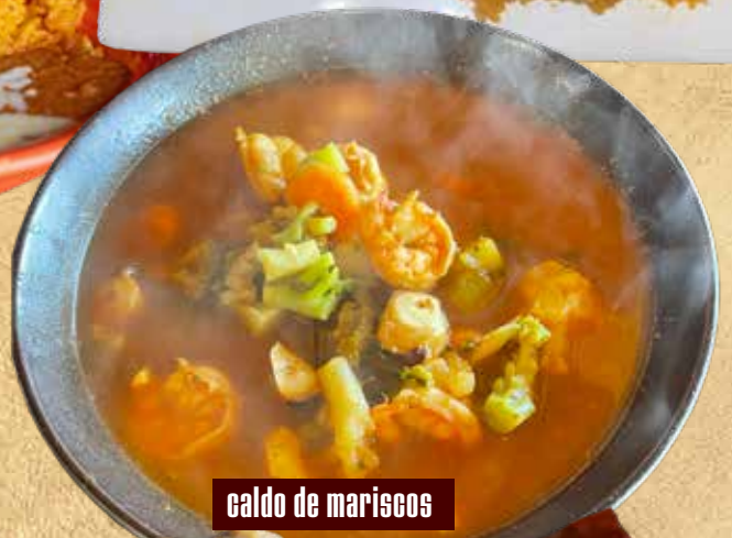
caldo de mariscos