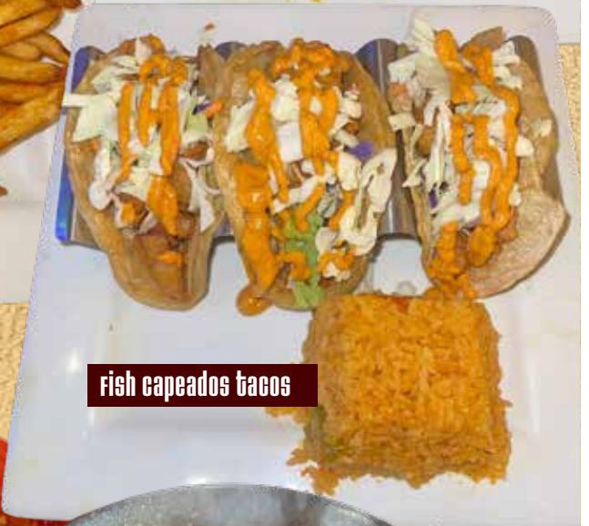
fish capeados tacos