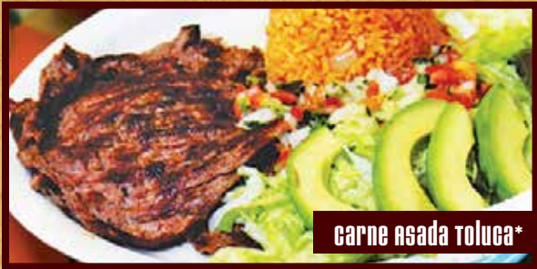
carne asada toluca*