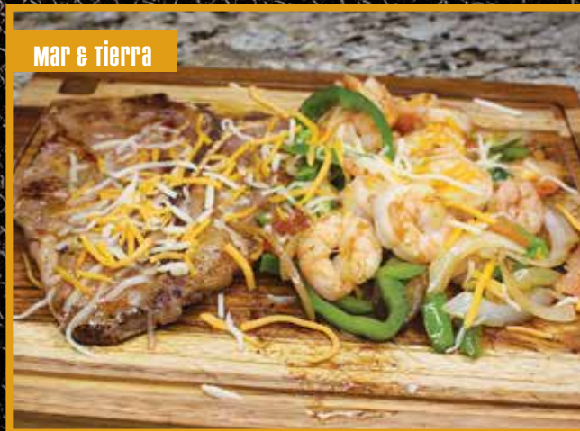
Mar & Tierra