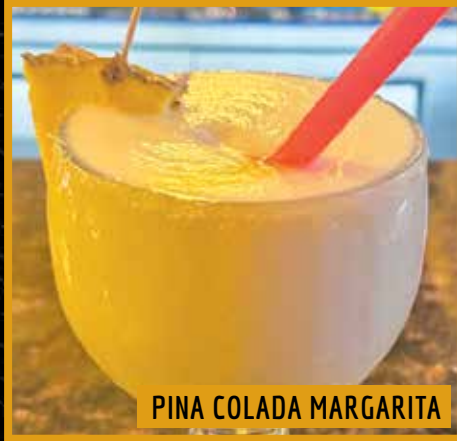
PINA COLADA MARGARITA