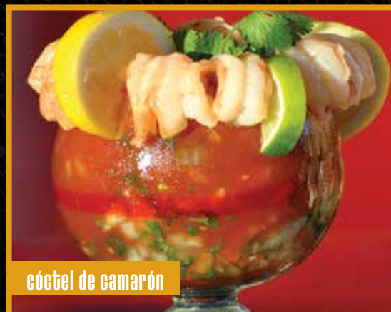
cóctel de camarón

Mango, tomatoes, onions and cilantro. Ask your server to make it SPICY - 18.99