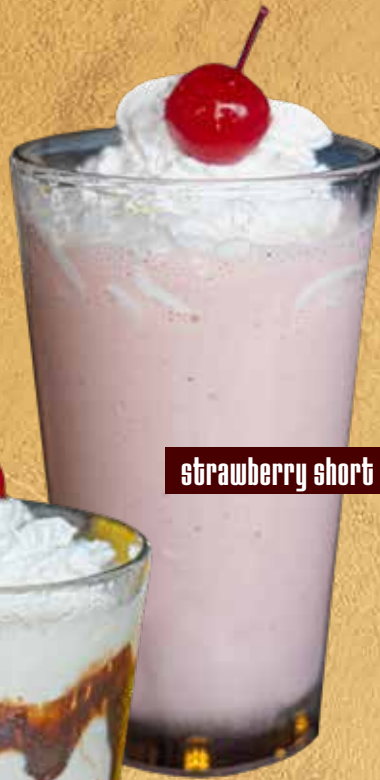
strawberry short cake