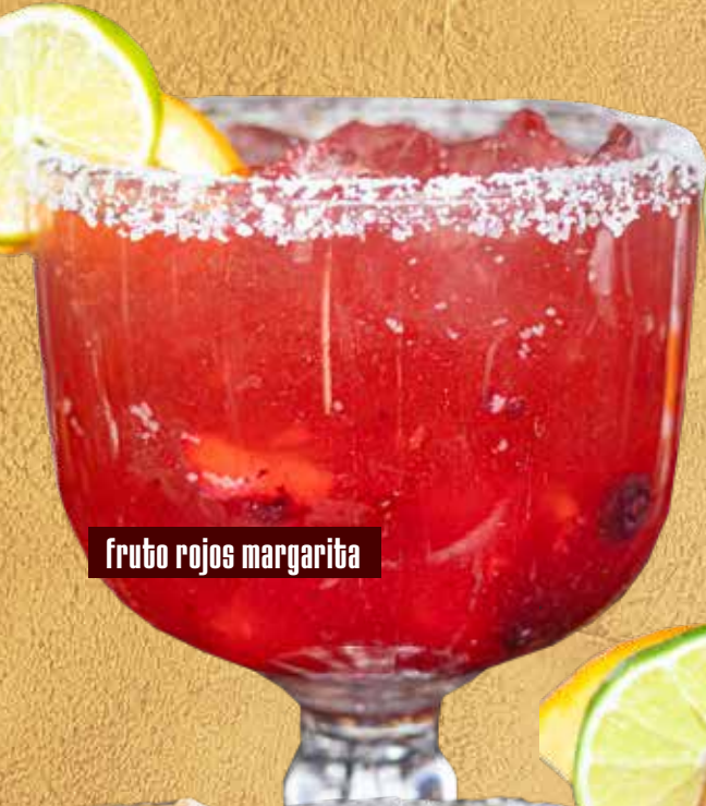
fruto rojos margarita