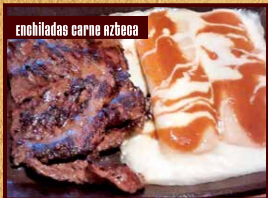
enchiladas carne azteca

Three juicy and flavorful Birria meat tacos with melty cheese, onions and cilantro. Served with rice and beans - 15.99