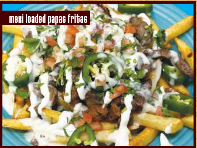
mexi loaded papas fritas