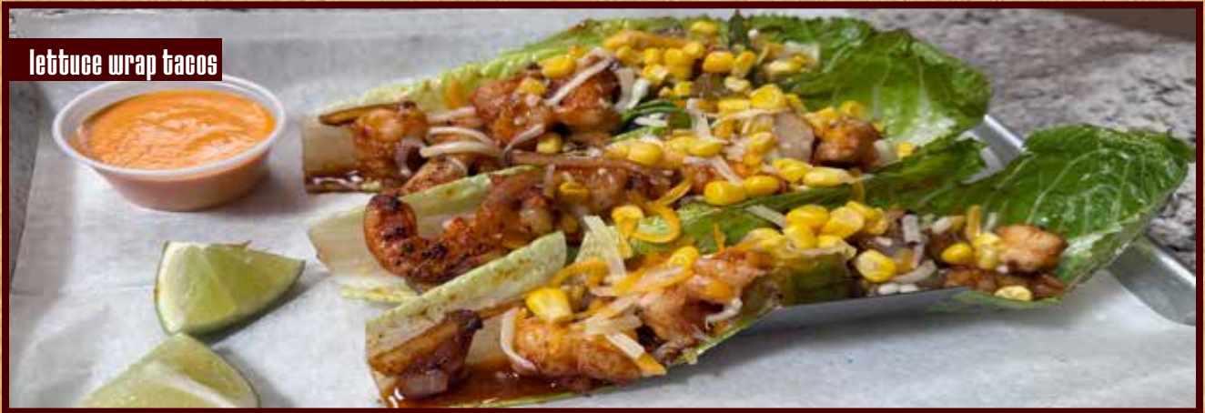
lettuce wrap tacos