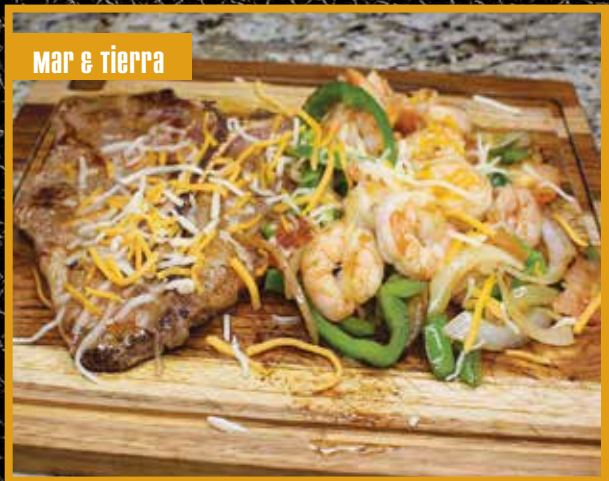
Mar & Tierra