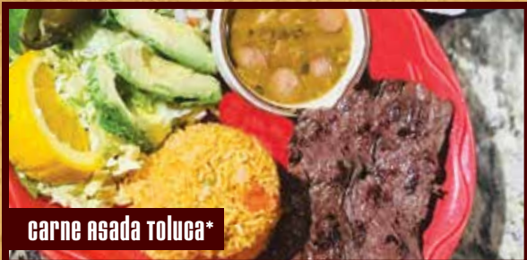
carne asada toluca*