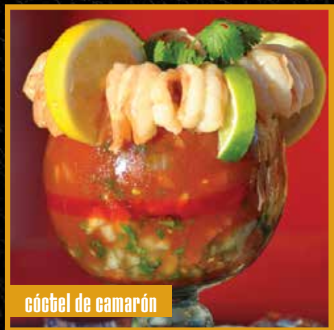
cóctel de camarón

Burrito filled with shrimp, grilled onions, peppers and tomatoes. Offered with a crisp taco shell stuffed with lettuce, guacamole and pico de gallo. Served with rice - 17.99