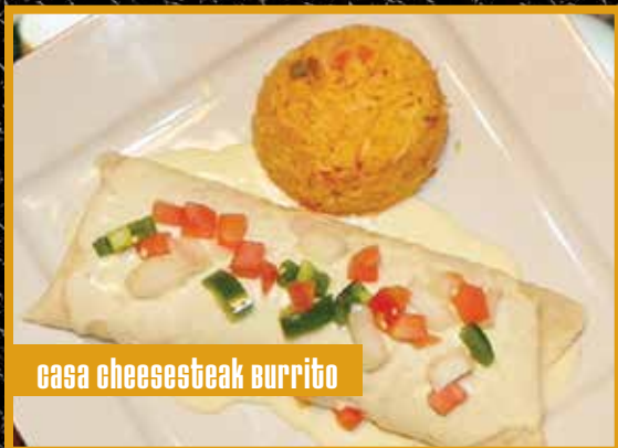
casa cheesesteak burrito