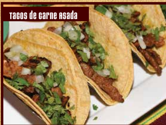
tacos de carne asada