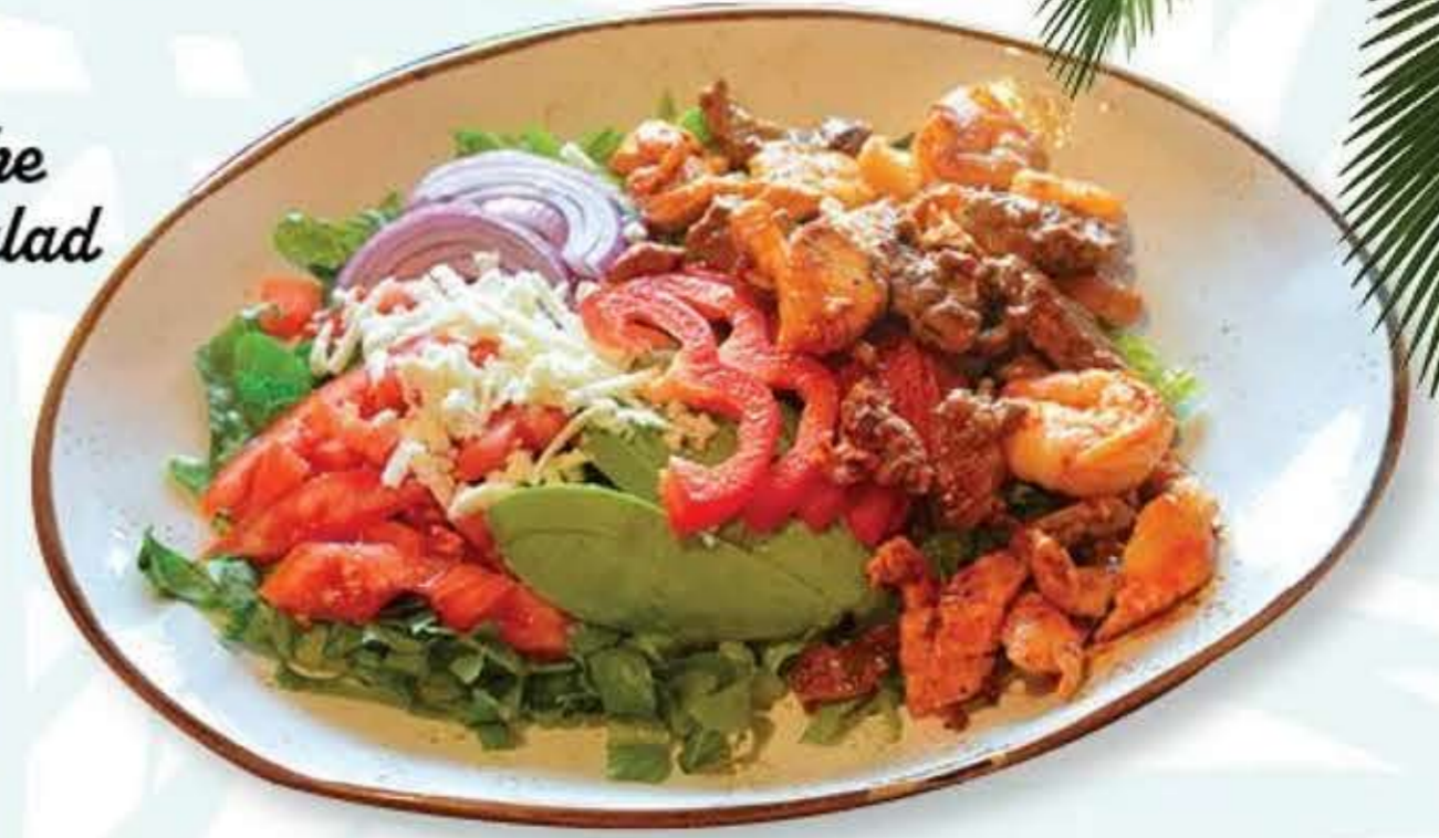
Across the Border Salad

Grilled steak, chicken and shrimp, served over a bed of lettuce with onions, bell peppers, avocado slices, fresh slice of onions, tomato, shredded cheese and Ranch dressing. 15