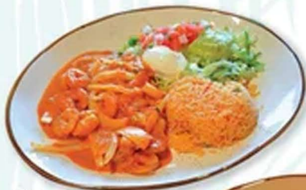
Shrimp Diabla Style

*GRILLED STEAK - GRILLED CHICKEN CARNITAS - PASTOR - CHORIZO - VEGGIES