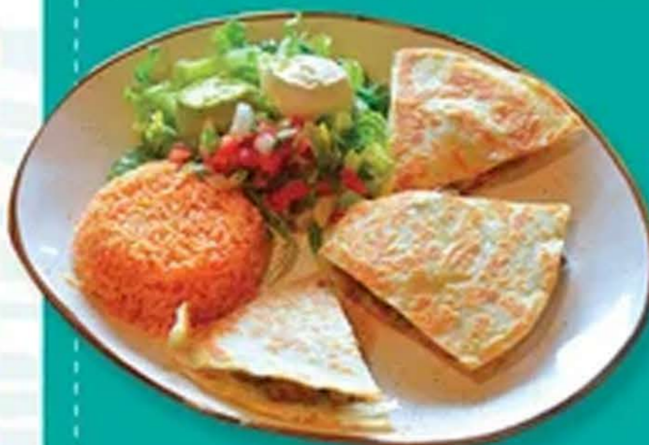
Quesadilla Street Style