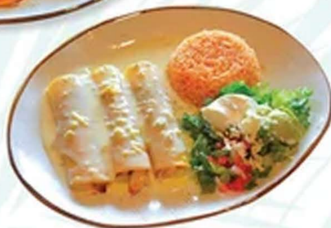
Enchiladas Street Style