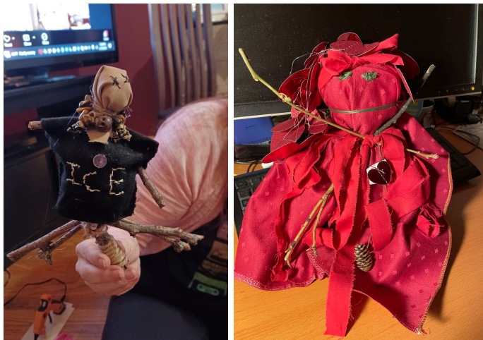
Creations from Poppet Protest Art night