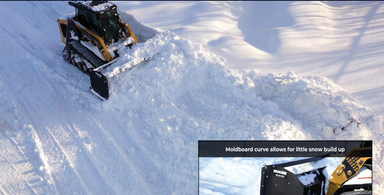
Moldboard curve allows for little snow build up