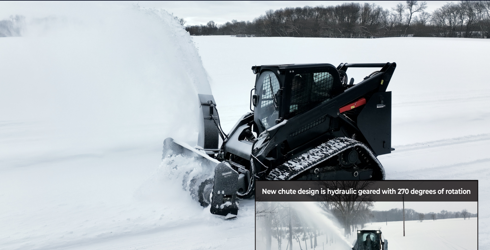
New chute design is hydraulic geared with 270 degrees of rotation