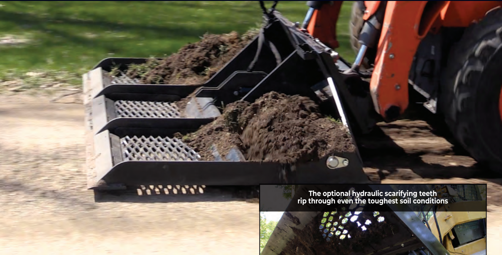
The optional hydraulic scarifying teeth rip through even the toughest soil conditions