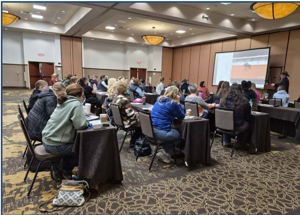
WHC Certified Judge Seminar attendees during the morning classroom session.