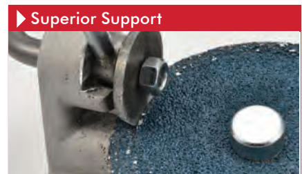
▶ Superior Support

Reuse larger discs by removing the outer diameter, effectively doubling or tripling disc life.