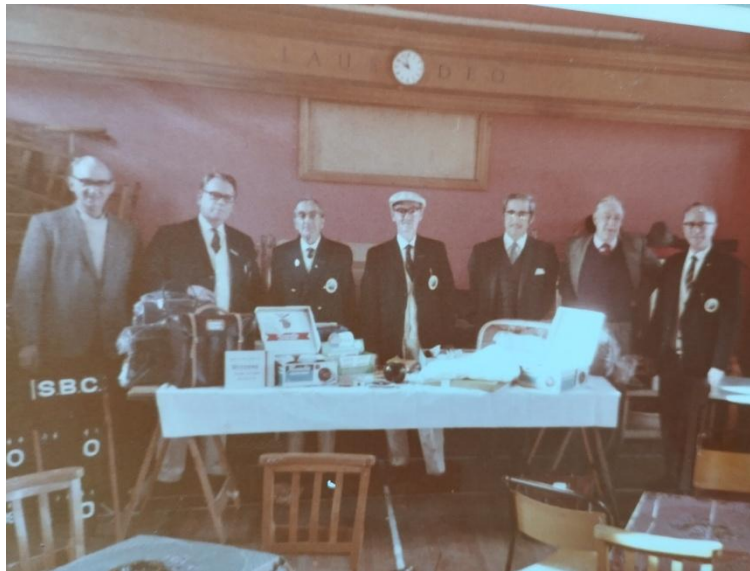
(The inaugural meeting)

The year 1971 was notable for a number of things: the best-selling record of the year was George Harrison's "My Sweet Lord" and on TV The Benny Hill show could draw an audience of over 20 million viewers.