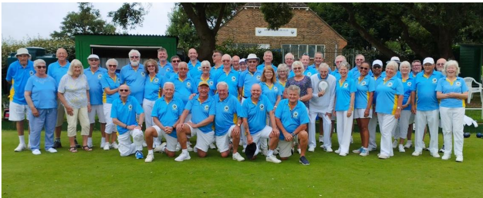
(The 2025 Members)

Over the years, as the dress code has relaxed, and the bowls are now made from a plastic composite material, available in almost any colour, the club has continued to prosper and gained a reputation as a friendly and welcoming place. So if you fancy giving it a go, come along to our Open Day on Saturday 25th April from 10am.