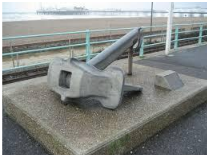
(The Athina B 's anchor is still displayed on Brighton seafront)

The ship remained on the beach for a month, guarded by the police to prevent looting. After a mobile crane was used to remove the cargo, she was re-floated and towed to a scrapyard at Rainham, Kent on the 21st February 1980, where she was scrapped.