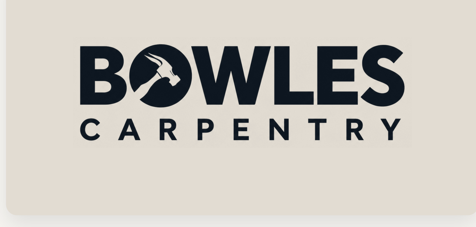
PRIMARY — ON LIGHT

A heavy, square-shouldered wordmark with a hammer nested in the O. Two colors only — ink navy on warm stone. Keep clear space around it; never recolor or stretch it.