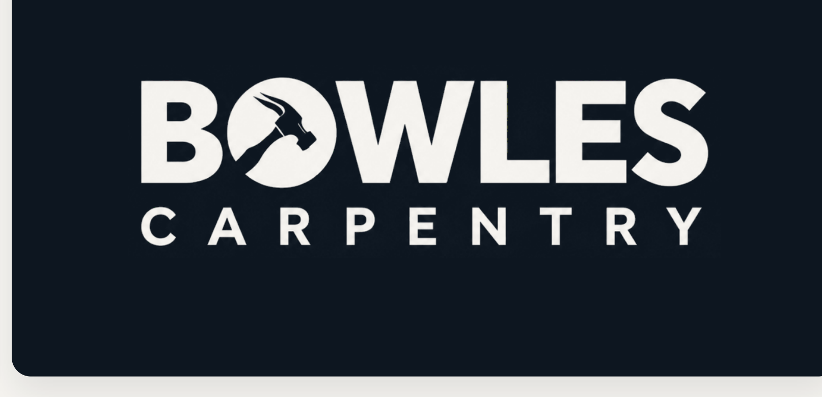
REVERSED — ON INK