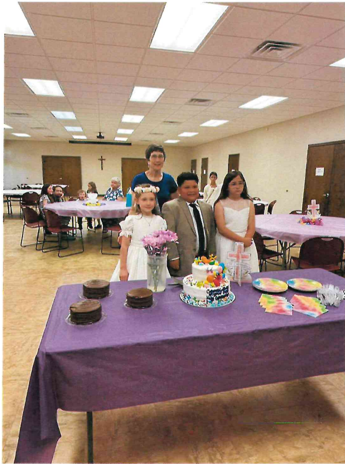
First Holy Communion, May 3, 2026