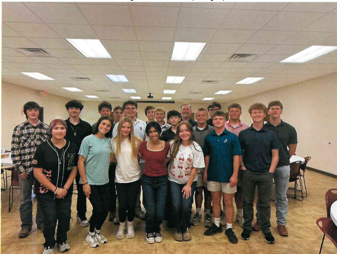
Confirmation Retreat - 2026