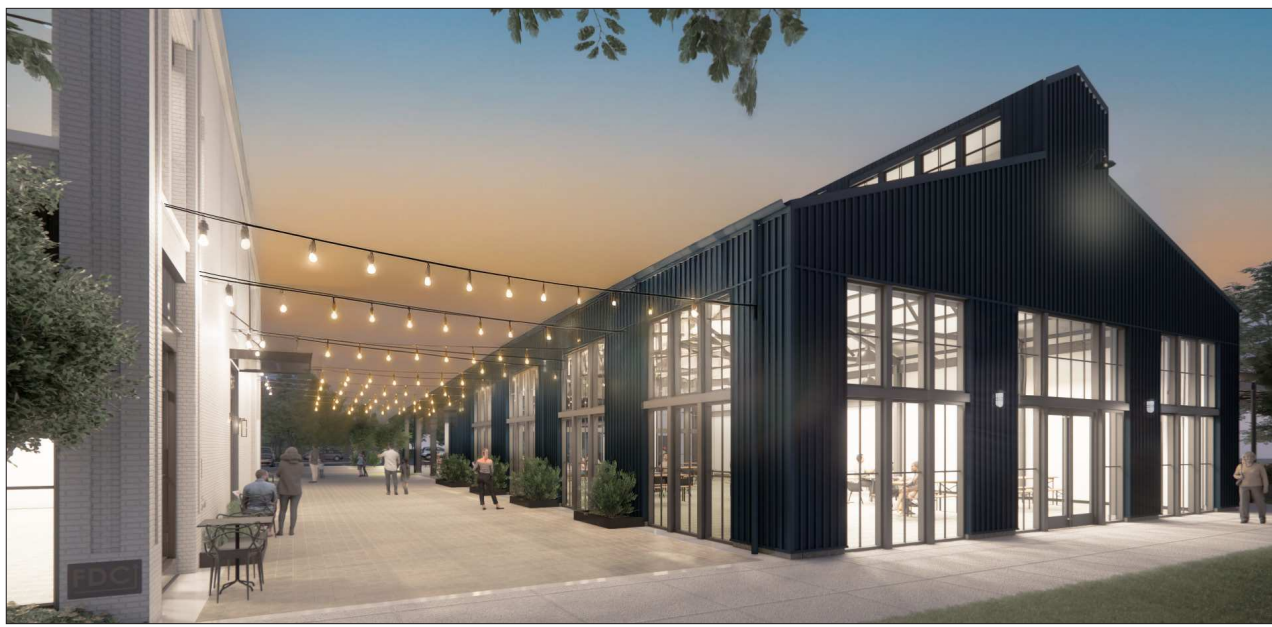
A rendering of Building A at the new Blackwells Corner development in Hanahan.