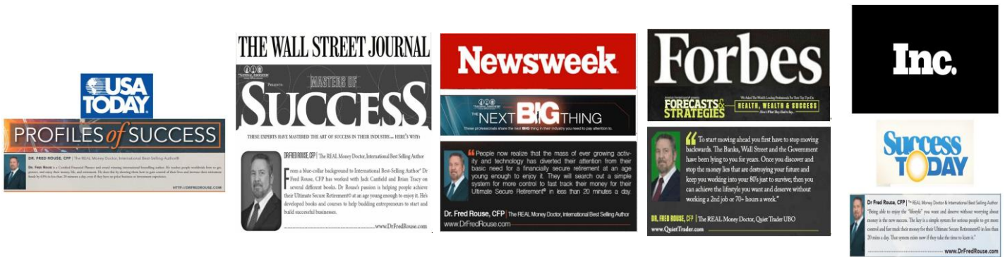
Selected press coverage, 2015 to present