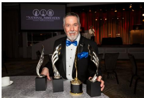
Multiple Expy and Quilly Award recipient National Association of Experts, Writers and Speakers