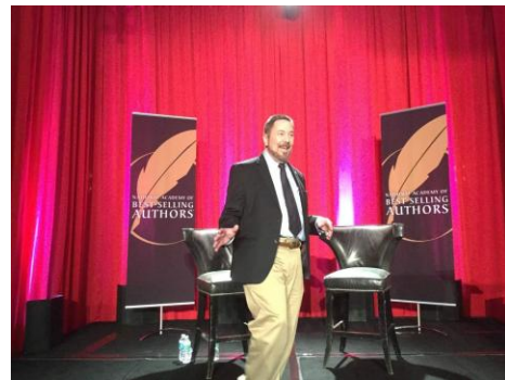
Featured speaker National Academy of Best-Selling Authors