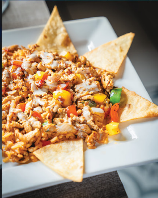
ARROZ CON POLLO & VEGETABLES