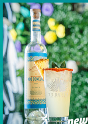
Smoked Pineapple Paloma new