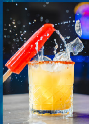
La Chica Fresa

Teremana blanco, pineapple juice, mango nectar $14