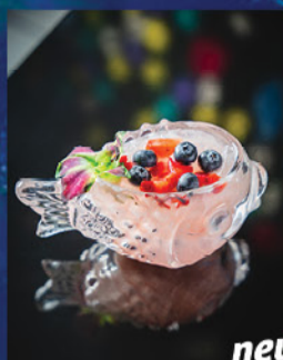
TROPICAL DELIGHT $16 new