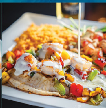
PLAYA DEL CARMEN