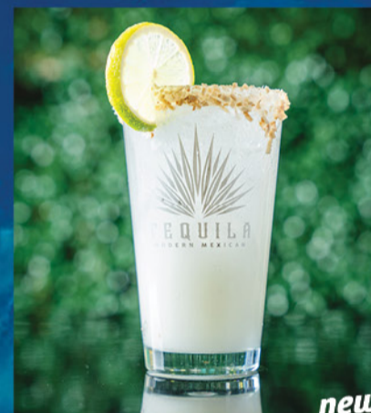
COCONUT TEQUILA LIME COOLER new