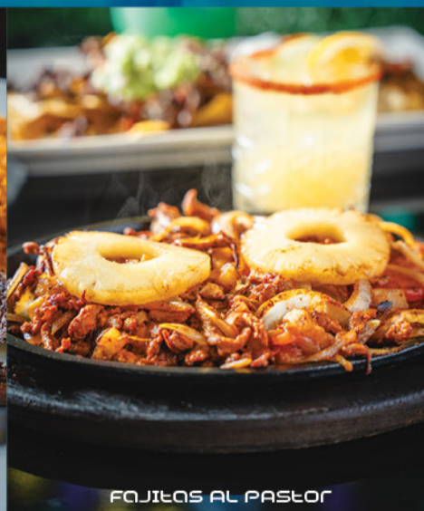
FAJITAS AL PASTOR