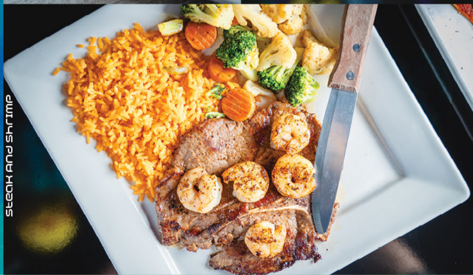
STEAK AND SHRIMP

NOTICE: FOODS COOKED TO ORDER, CONSUMING RAW OR UNDERCOOKED MEATS, POULTRY, SEAFOOD, SHELLFISH OR EGGS MAY INCREASE YOUR RISK FOR FOOD BORNE ILLNESSES, ESPECIALLY IF YOU HAVE CERTAIN MEDICAL CONDITIONS. TO OUR GUESTS WITH FOOD SENSITIVITIES OR ALLERGIES: WE CANNOT ENSURE THAT MENU ITEMS DO NOT CONTAIN INGREDIENTS THAT MIGHT CAUSE AN ALLERGIC REACTION.