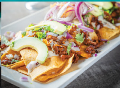
NACHOS AL PASTOR