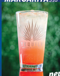
PALOMA ROSA $16 new