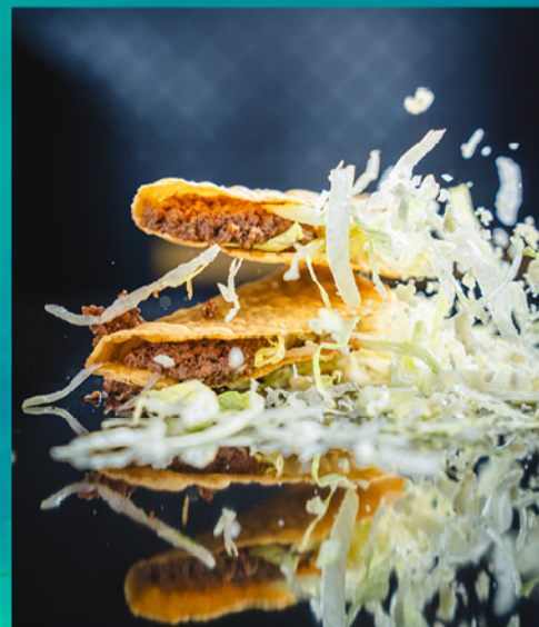
HARD SHELL TACOS