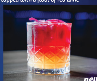
SOMBRA MARGARITA $14 new

Arcoiris: Vodka, grenadine, orange juice, and a blue curacao Hasta la Vista Baby: Rum, vodka, gin, tequila, triple sec, blue curacao, sweet and sour, and a splash of Sprite La Familia: Buchanan's pineapple, agave nectar, St Germain, fresh lime juice, tajin, and a splash of soda water Tulum: Vodka, Malibu, blue curacao, orange juice, and a splash of sprite Tropical Delight Vodka, coconut cream, strawberry, guava, apple juice and coconut water. Smoky Piña Rita: 400 Conejos mezcil, lime juice, agave nectar, orange juice, pineapple juice and gran gala Sombra Margarita: Regular Margarita topped with a float of red wine