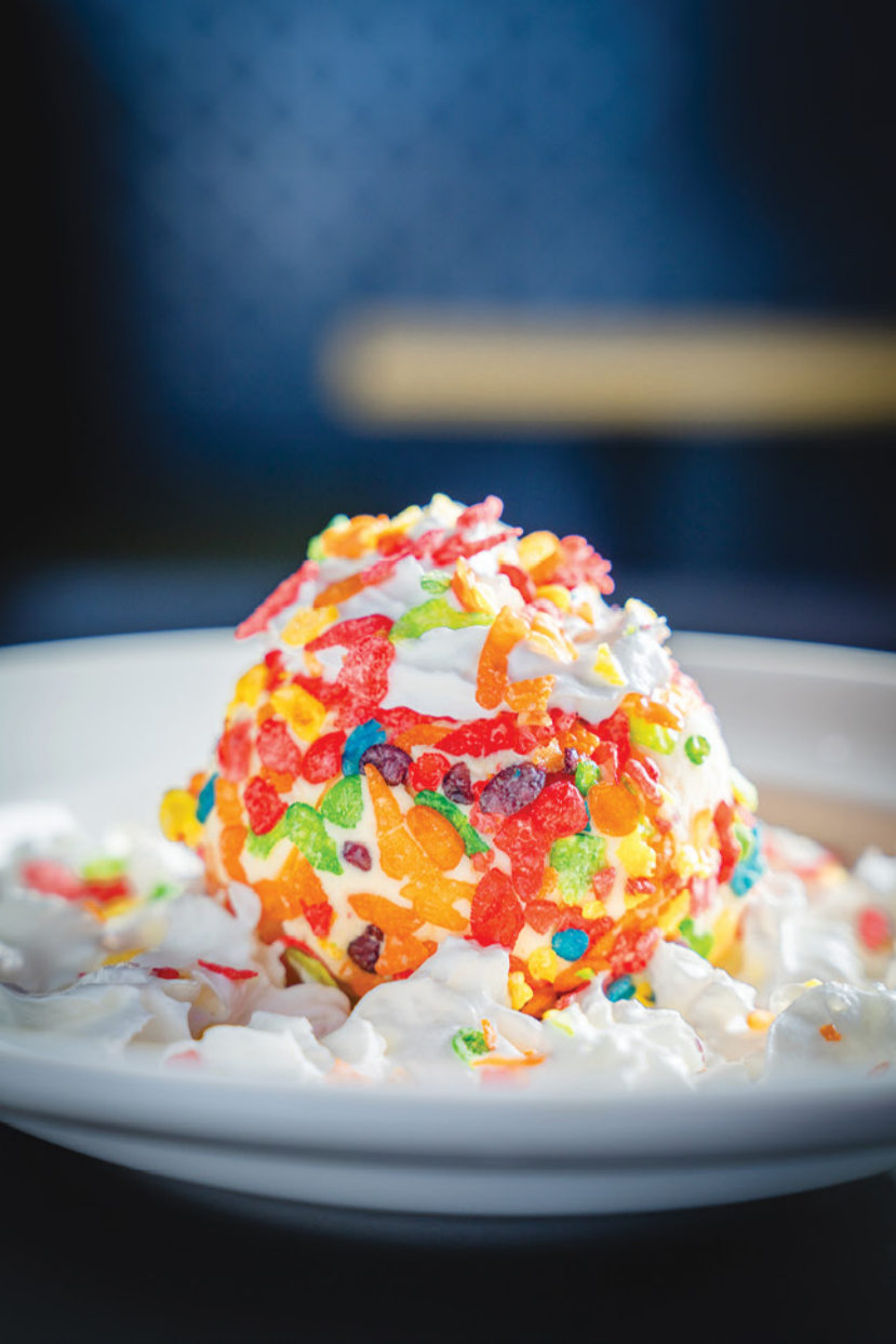
FRUITY PEBBLES FRIED ICE CREAM