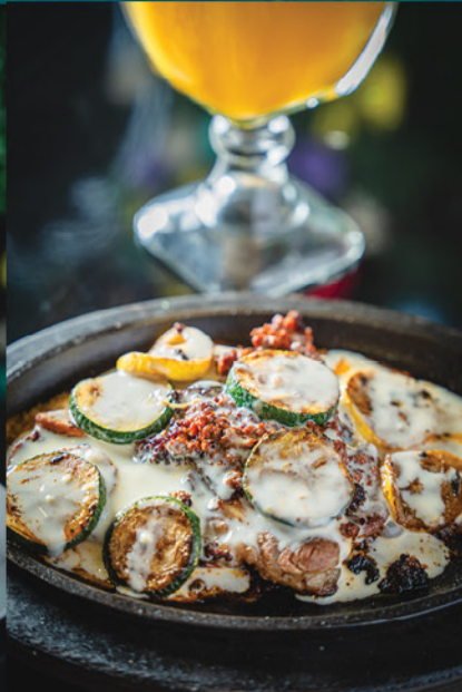
STEAK DON LUPITO