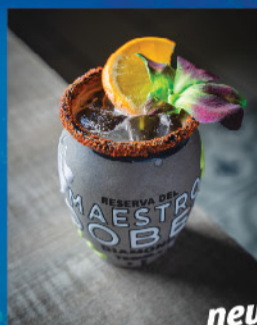
ENCANTO $16 new