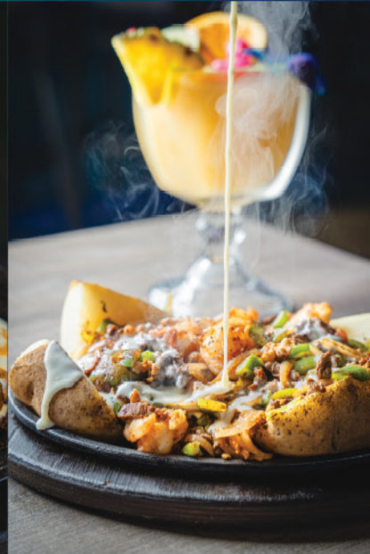
BAKED POTATO FAJITA