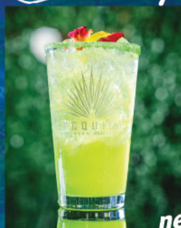
MELON BREEZE MARGARITA $16 new