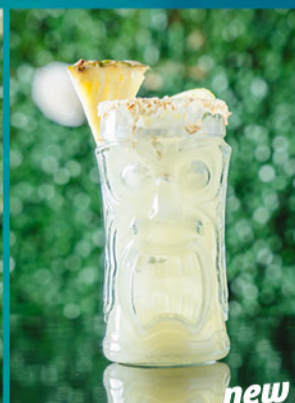
Pineapple-Coconut Margarita new