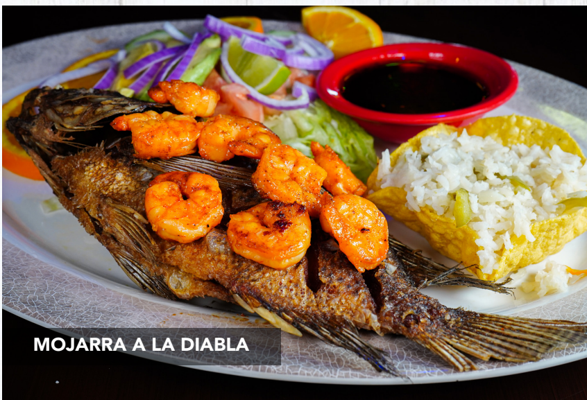
MOJARRA A LA DIABLA