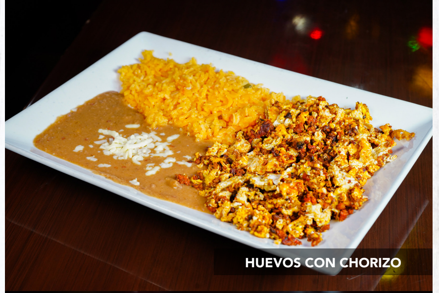
HUEVOS CON CHORIZO