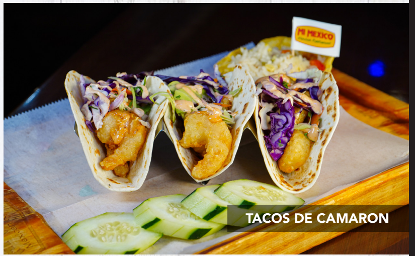
TACOS DE CAMARON