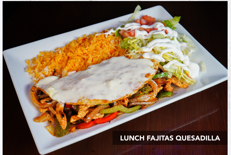
LUNCH FAJITAS QUESADILLA

Grilled steak with onions, topped with cheese sauce. Served with rice, lettuce, tomatoes, sour cream, and cheese dip.