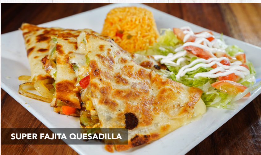
SUPER FAJITA QUESADILLA

Flour tortilla filled with cheese and seasoned barbacoa. Served with consommé, rice, pickled onions, cilantro, radishes, and cucumbers.