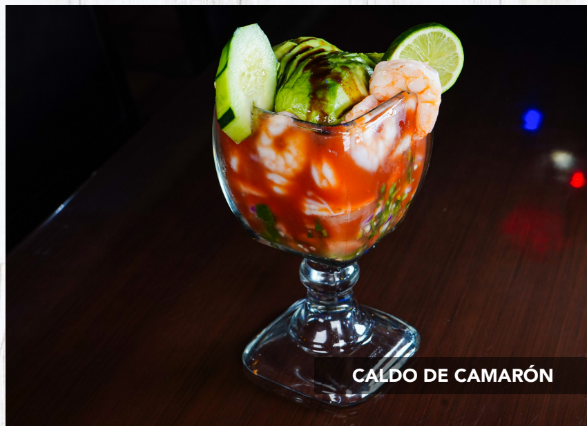
CALDO DE CAMARÓN