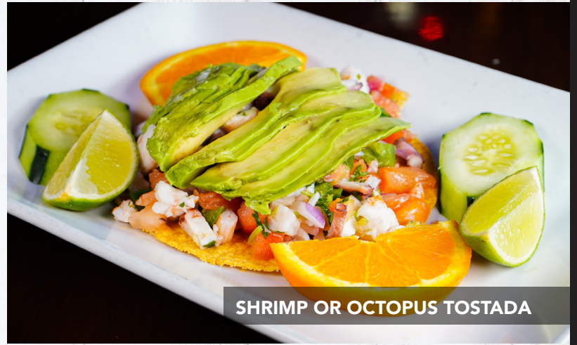
SHRIMP OR OCTOPUS TOSTADA

Your choice of chicken or ground beef served over a bed of Doritos, topped with fresh pico de gallo.