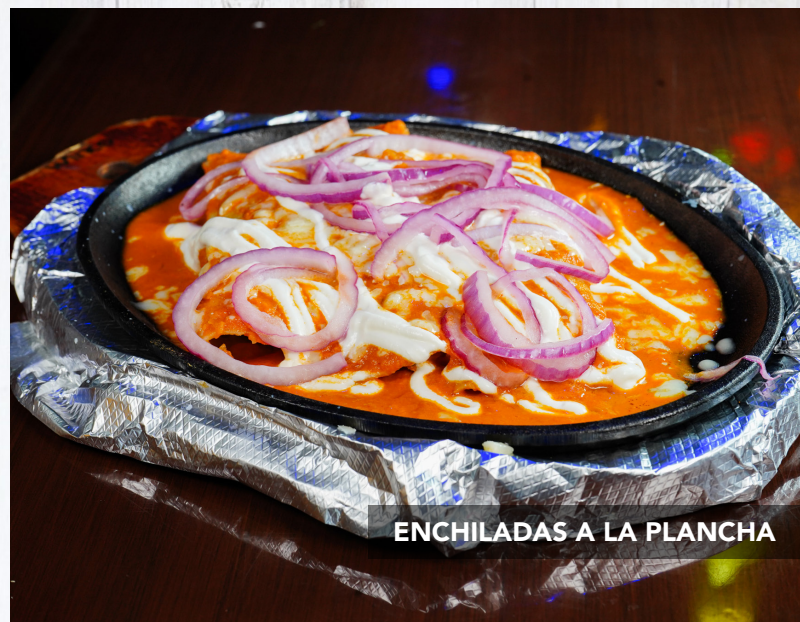
ENCHILADAS A LA PLANCHA

One chicken, one ground beef, and one pork enchilada, topped with red sauce, sour cream, cilantro, and onions. Served with rice and beans.