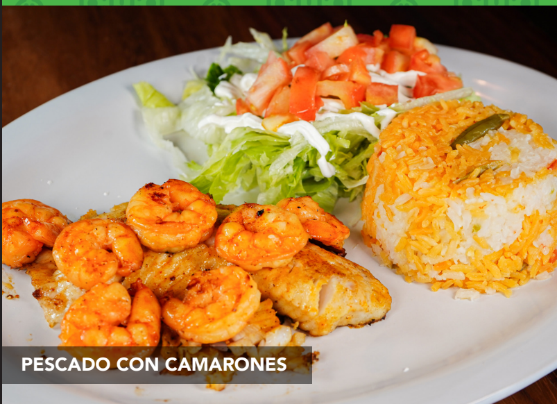
PESCADO CON CAMARONES