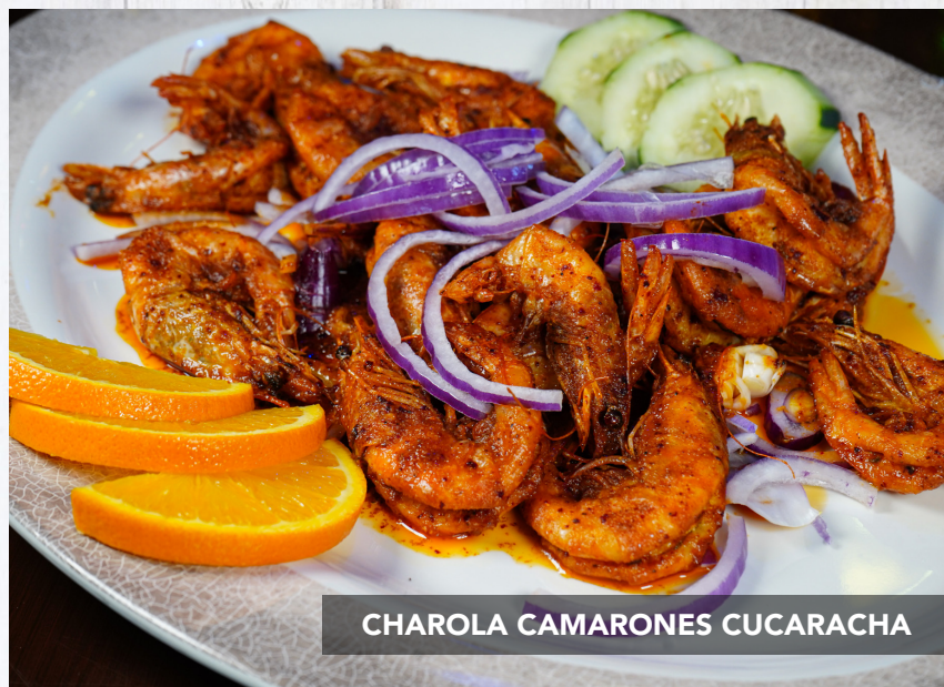
CHAROLA CAMARONES CUCARACHA

Shrimp prepared with dried arbol chile, guajillo chile, lime, and special Nayarit sauce.