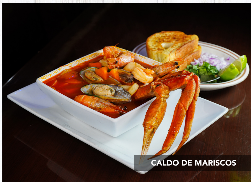
CALDO DE MARISCOS