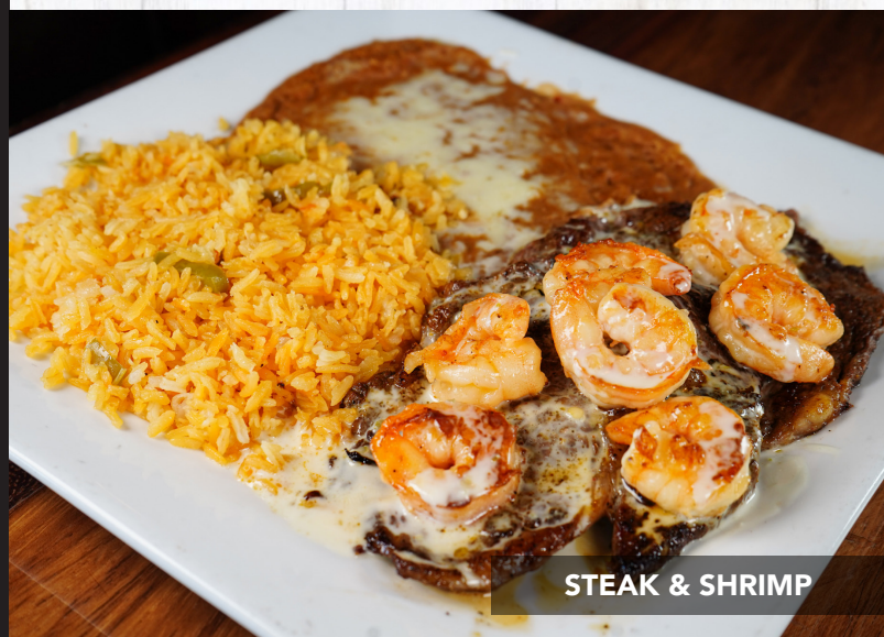
STEAK & SHRIMP