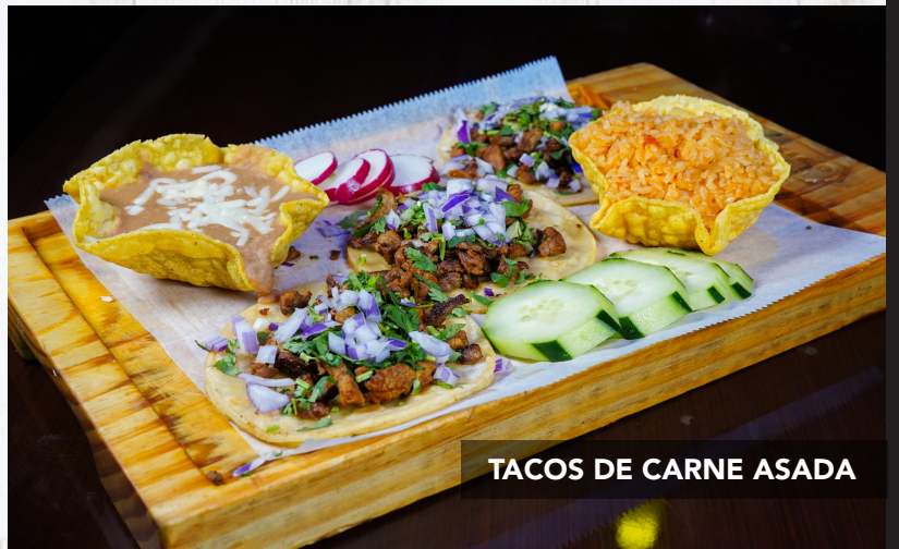
TACOS DE CARNE ASADA