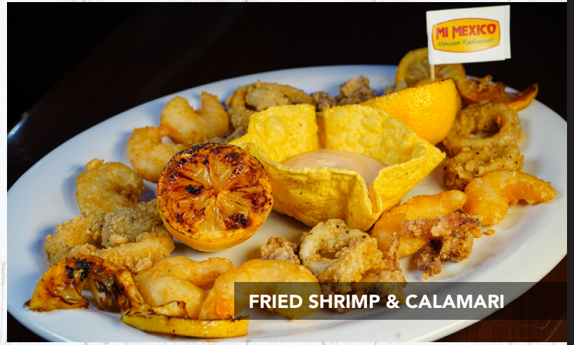
FRIED SHRIMP & CALAMARI