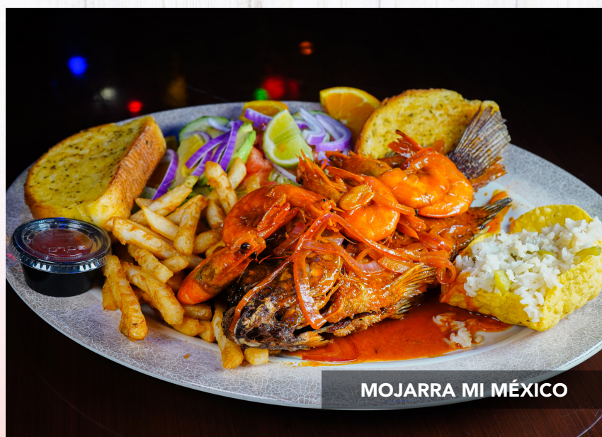
MOJARRA MI MÉXICO

EATING RAW OR UNDERCOOKED MEAT, POULTRY, SEAFOOD, SHELLFISH OR EGGS MAY INCREASE YOUR RISK OF FOODBORNE ILLNESS. AND THOSE WHO HAVE CERTAIN MEDICAL CONDITIONS ARE AT GREATER RISK. YOUNG CHILDREN, PREGNANT WOMEN, OLDER ADULTS.