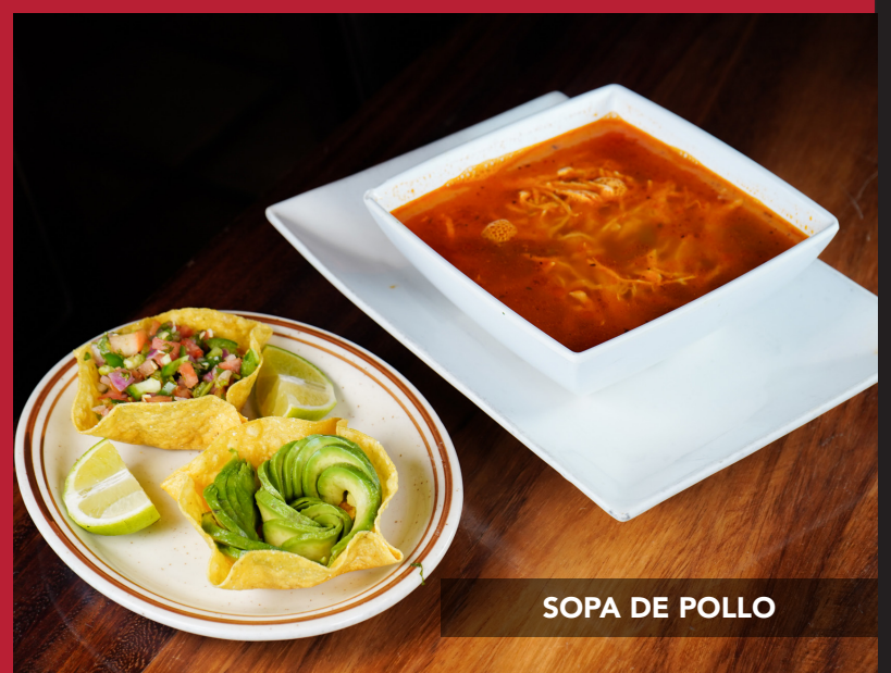
SOPA DE POLLO