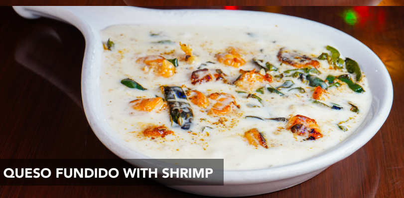
QUESO FUNIDIDO WITH SHRIMP